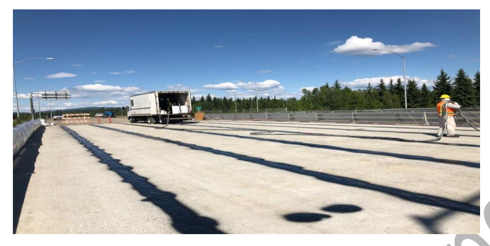
Figure 1MagnoMembrane Filled Girder Joints