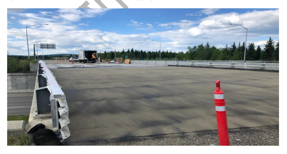
Figure 3MagnoMembrane Top Coat with aggregate