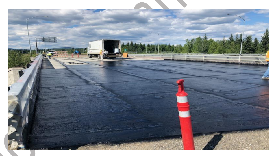
Figure 2MagnoMembrane Base Coat without aggregate