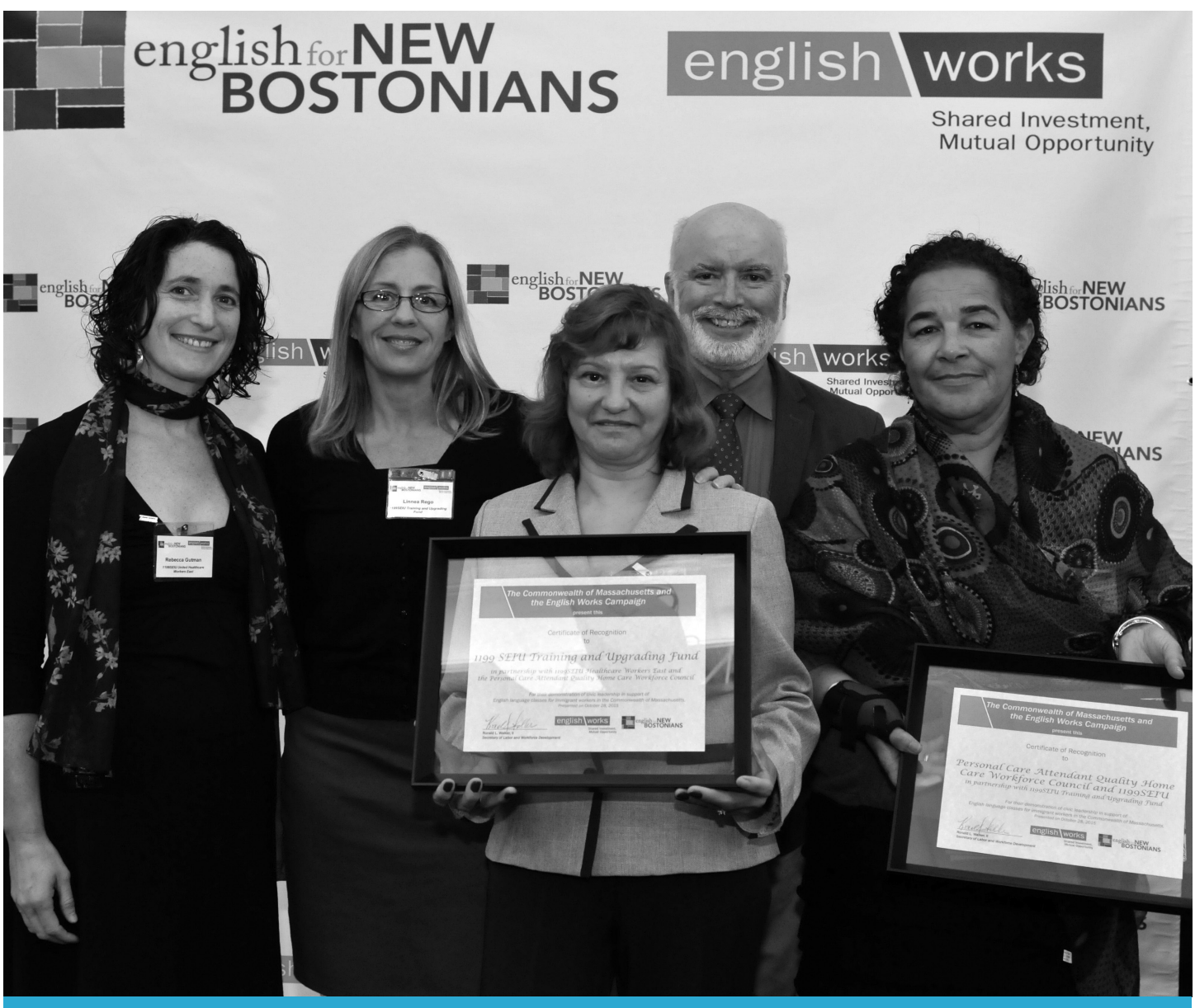
Members of the 1199SEIU Training & Upgrading Fund, 1199SEIU Healthcare Workers East, and the Personal Care Attendant Quality Home Care Workforce Council, posing with their awards.

"Partnerships like the one we are recognizing today, 1199SEIU Training and Upgrading Fund with 1199SEIU Healthcare Workers East and the Personal Care Attendant Quality Home Care Workforce Council, offer lifechanging benefits to members, including ESOL classes, through collective bargaining."