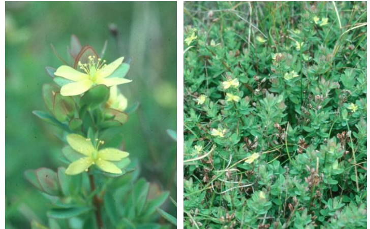
St. Andrew's Cross showing the four-lobed flowers on the left, and the clumped stems on the right.

DESCRIPTION: St. Andrew's Cross is a low shrub (up to 30 cm; 1 ft.) of the St. John's-wort family (Clusiaceae), known for its distinct flower shape. The four bright yellow petals make an oblique cross at the stem tips, which contrast against the dark green foliage. St. Andrew's Cross is often found in clumps in dappled sunlight and forest edges as a low ground cover. The woody stems are slender and reddish. The leaves are evergreen, opposite, and sessile, 1 to 3 cm in length; they are slightly waxy and narrowly oblong in shape, with smooth margins. Solitary yellow flowers bloom at the branch tips and uppermost axils in mid-summer, and are insect-pollinated. The flowers are small (8–11 mm), with narrow petals and numerous stamens. Once fertilized, the sepals enclose the swelling fruit. The emerging egg-shaped capsule contains many small round, black seeds. Seed capsules split open when mature. Dry seed capsules turn reddish brown and can remain on the plant through the winter.