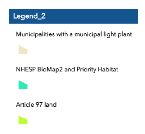
Figure 2: MA EOEEA BioMap2 – Legend for Ineligible Land Use

According the map's legend, Core Habitat and Critical Natural Landscape are referred to as Biomap2. These data layers are combined with Priority Habitat and are identified as the dark green. Any land that parcel whose area is comprised of at least 50% of these designated land types is shown in dark grey. Article 97 land is displayed as a light green.