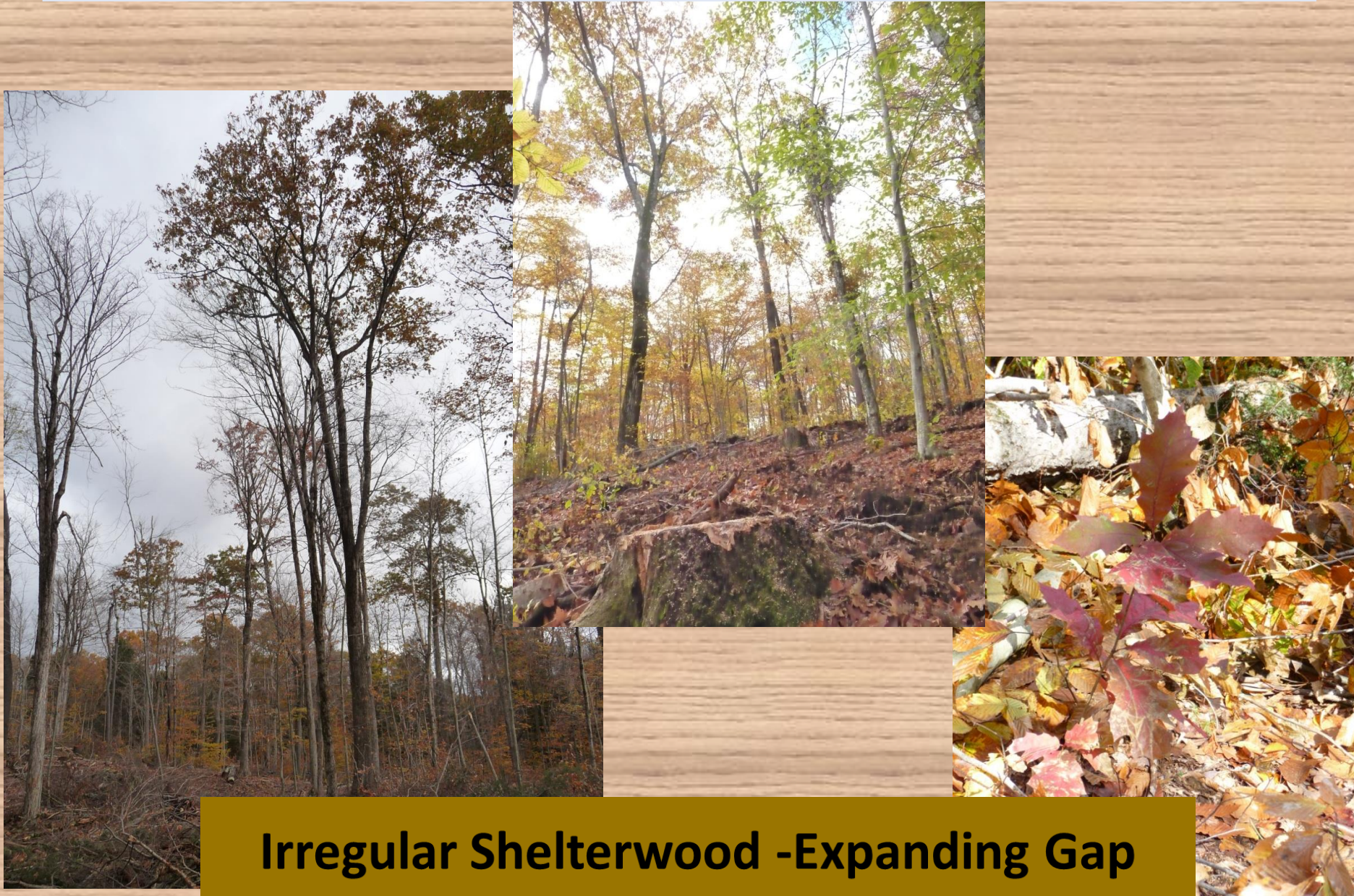
Irregular Shelterwood -Expanding Gap