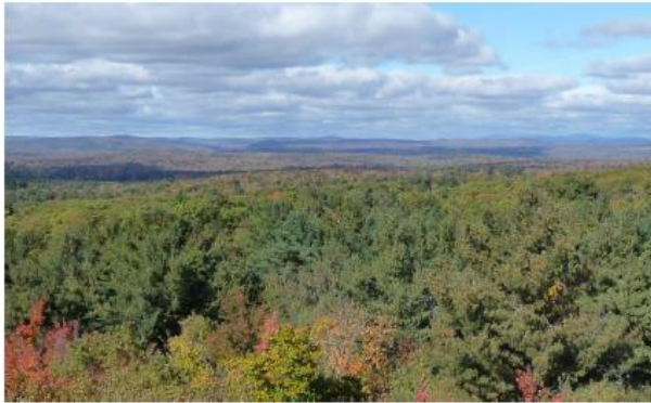
View from the D.A.