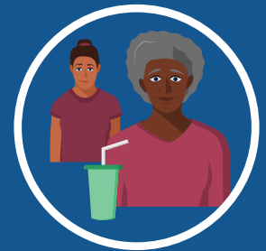
CHITA YON DISTANS 6 PYÈ OSWA MANJE YOUN APRE LÒT