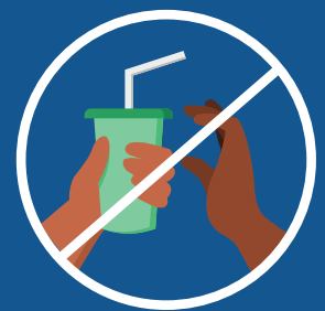
PA MANJE NAN MENM PLAT NI PA BWÈ NAN MENM GODE.