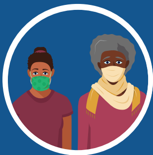
METE MASK ANNDAN LÈ NOU YON DISTANS MWENS KE 6 PYÈ