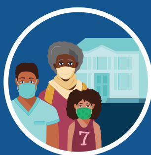
METE YON MASK LÈ W DEYÒ LAKAY OU