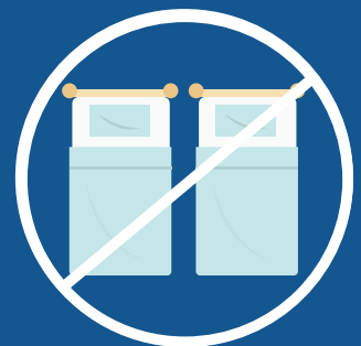
PA DÒMI NAN MENM CHANM

Aprann plis bagay nan Mass.gov/StopCOVID19