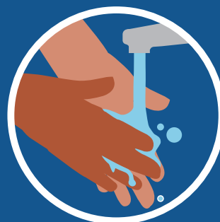
LAVE MWEN W LÈ TOUNEN LAKAY OU