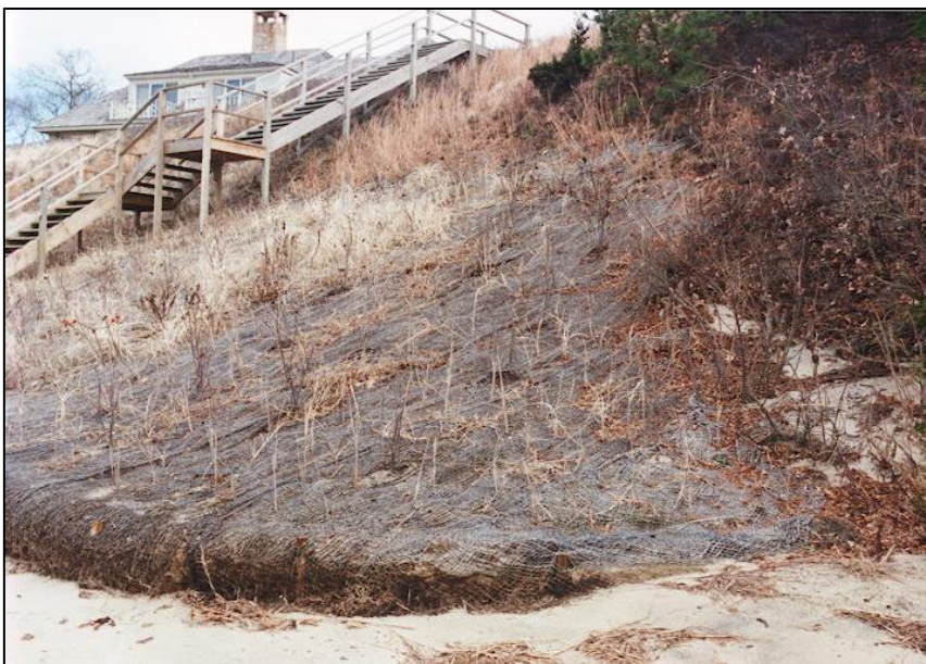
This bioengineering project with coir rolls, natural fiber blankets, and vegetation was designed to minimize erosion on the adjacent property. At the end of the property, the number of rolls was tapered down to one and the bank's slope was reduced and blended in to the adjacent bank.

techniques. Wooden stakes are biodegradable but do not always hold well in areas with higher wave energy. Earth anchors, which are typically used for sites exposed to higher rates of erosion, consist of a metal duckbill anchor that