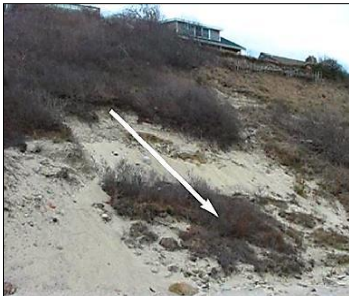
Waves and tides eroded the toe of this bank, causing this collapse of a well vegetated section of the bank face.

For sites exposed to high wave energy, it may be necessary to replace and maintain coir rolls at the toe of the bank to provide longer-term stability. If the beach in front of the bank is narrow or narrows over time, if the beach elevation is too low or erodes down over time, or if the shoreline has a steep drop off below the low tide line, it may be necessary to combine bioengineering with other techniques, such as dune and beach nourishment, to ensure a successful project. (See the following StormSmart Properties fact sheets for more information: Artificial Dunes and Dune Nourishment and Beach Nourishment .) A professional with demonstrated success installing bioengineering projects in dynamic environments should be consulted to assess each site and make recommendations regarding the appropriate technique or combination of techniques.