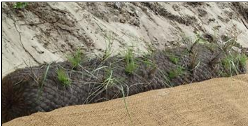
This coir roll has been planted with vegetation prior to installation.

Coir rolls are often used in conjunction with other techniques for erosion management, such as natural fiber blankets, runoff control, and beach nourishment. Natural fiber blankets are woven mats of natural fibers that are used to stabilize the ground surface while plants become established. Runoff control projects reduce and slow the flow of water over the ground surface, reducing coastal erosion problems. Beach nourishment adds sediment (i.e., sand, gravel, and cobble) from an off-site source to address beach erosion issues. See the following StormSmart Properties fact sheets