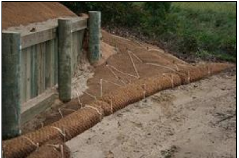
A coir roll, natural fiber blanket, and fill were installed to minimize erosion at the end of this bulkhead.

For coastal bank projects, coir rolls can be used on both sheltered sites and sites exposed to wave energy. However, they are most effective in areas with higher beach elevations with some dry beach at high tide, where the rolls are not constantly subject to erosion from tides and waves. If the dry beach is narrow, the beach elevation is relatively low, and/or the site is exposed to moderate wave energy, more than one row of coir rolls will likely be needed on the face of the bank, as well as at the base. In these exposed conditions, the rolls will have a shorter lifespan and will require more frequent maintenance such as resetting, anchoring, or replacement. Additional erosion-control options may be needed at these sites, such as beach nourishment (see StormSmart Properties Fact Sheet 8: Beach Nourishment ). It is essential to have a site-specific evaluation conducted by a professional with demonstrated experience and success implementing coir roll projects in exposed settings to determine the viability of coir rolls in these areas.