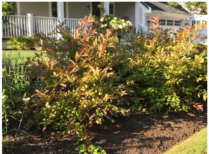
This planting bed, which replaced lawn area, helps absorb rain and infiltrate water before it flows to the road.