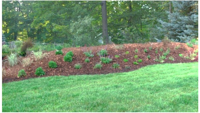
A mulched and newly planted berm has been installed to help block the flow of stormwater that heads downslope from the lawn.

berm can be covered with a layer of topsoil and planted with live plants, or the berm soil can be stabilized with a natural fiber blanket while seeds become established. Berms require routine maintenance, such as watering, pruning, weeding, mulching, and replacing vegetation as necessary. Berms should also be inspected once every 3-6 months, as well as after large storm events, to determine if plants need to be replaced or portions of the berm need repair. For more information, see the Massachusetts Clean Water Toolkit's Filter Berm page .