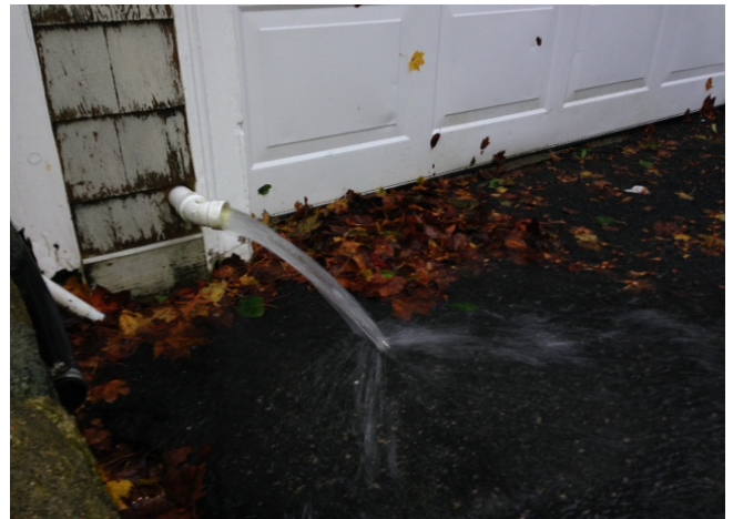
What NOT to do—This sump pump drains onto an asphalt driveway, causing contaminated runoff to flow directly into the road and nearby storm drains.