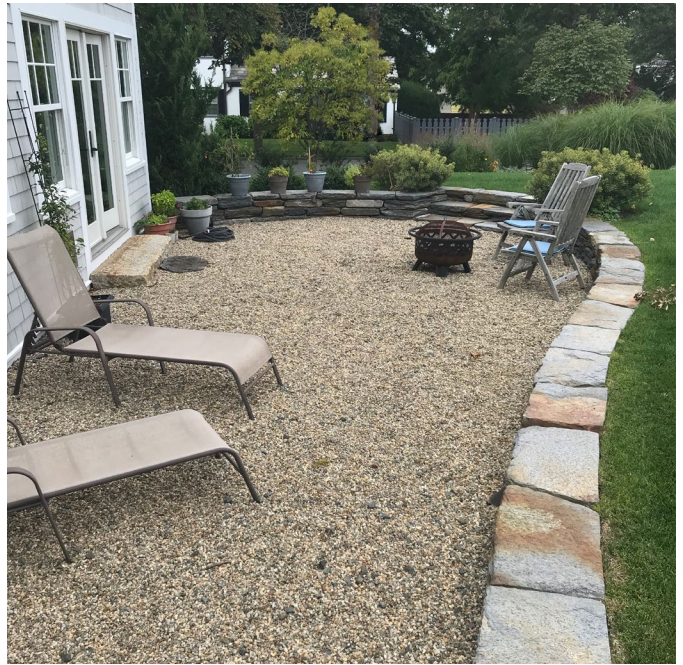
To allow rainwater to infiltrate, this patio was designed with pea gravel rather than mortared stone, bricks, or other impervious options.