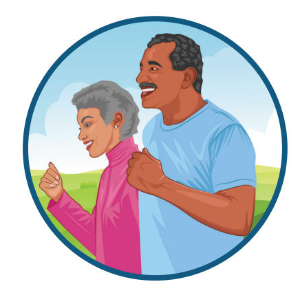
Get active whenever you can! Try for 30 minutes a day, five days a week.