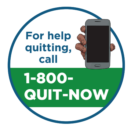
Quitting smoking and vaping lowers your risk! Tobacco and nicotine increase your risk for stroke by raising your blood pressure.