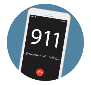
TIME is critical