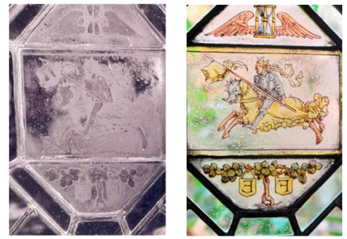
Restored Stained Glass

For more information about the Historic Curatorship program, please visit https://tinyurl.com/hcp-ma or contact hcp.requests@mass.gov .