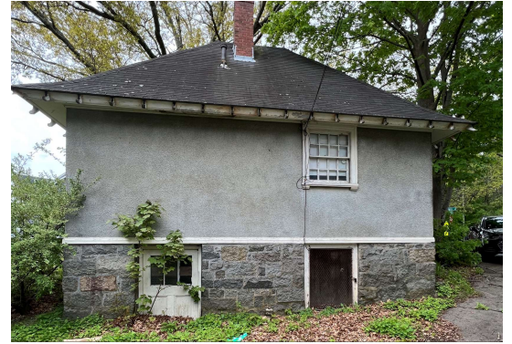
Rear Elevation from Driveway