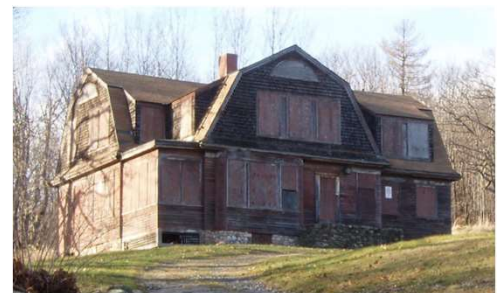
Wachusett Supt' House Before Restoration