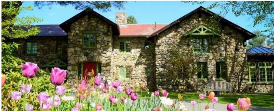
Bradley Palmer Mansion Restored

Within the Commonwealth's 450,000 acres of State and Urban Parks are a number of unused, historically significant buildings. The Historic Curatorship Program, established in 1994, is a national model that has helped DCR preserve many of its underutilized but historically significant properties by partnering with outside parties who exchange rehabilitation, management and maintenance services for credit towards a long-term lease. As a result, DCR secures the long-term preservation of historic sites threatened by vandalism and the elements, and Curators live or work in a uniquely pastoral setting.