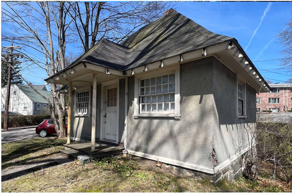
Building from Front Lawn