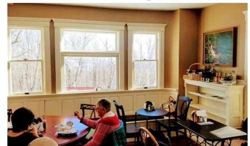
Wachusett Supt' House Interior Restored