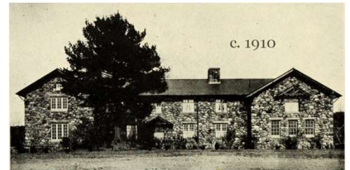
Bradley Palmer Mansion c.1910