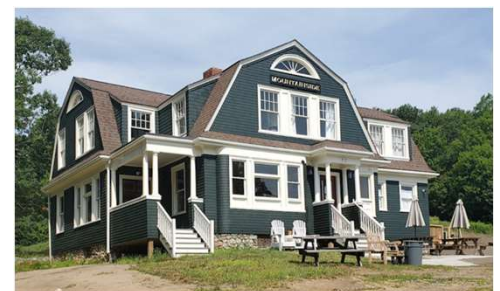
Wachusett Supt' House Restored