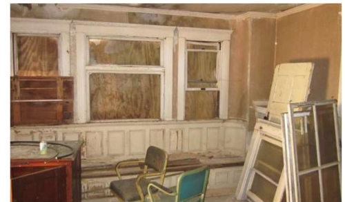
Wachusett Supt' House Interior