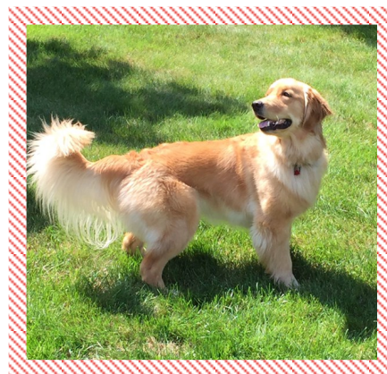
"Maggie" from Mansfield

Would you like to see your pet in a future issue?