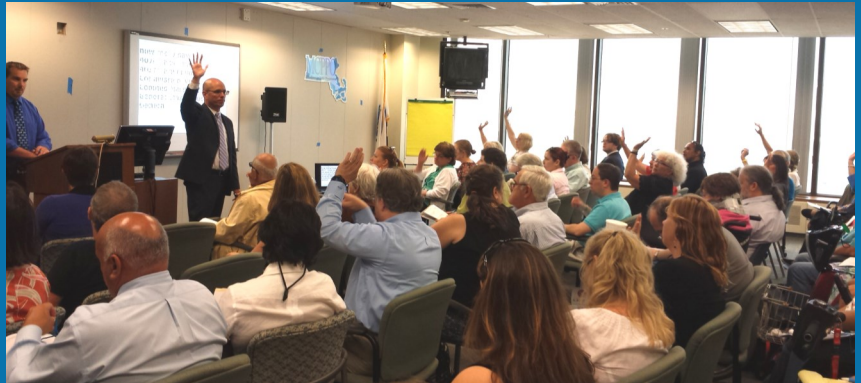
Statewide COD Meeting