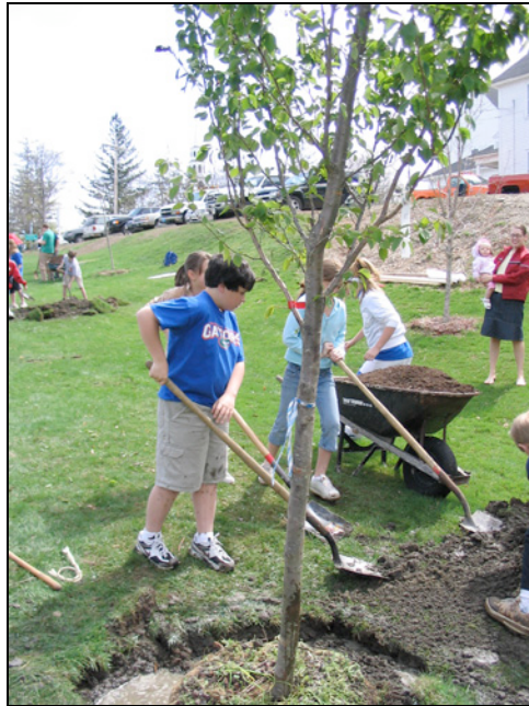
Arbor Day Tree Planting, 2007