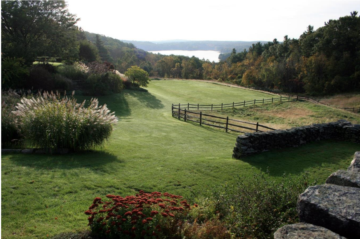
Image: Lake Manchaug 1