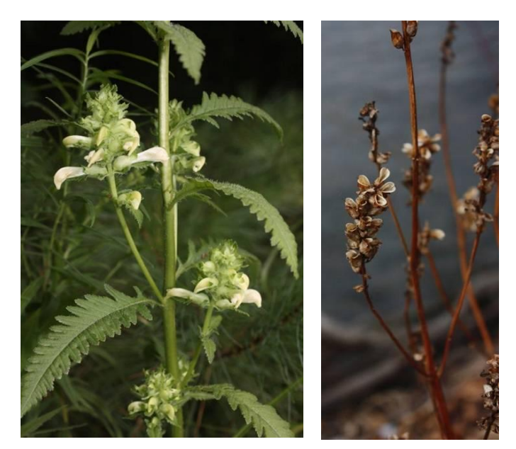
Swamp Lousewort, flowering and winter views.

State Status: Endangered Federal Status: None