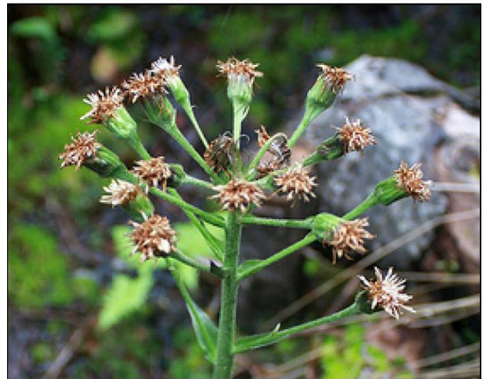
Top - Flowering stem, Québec. Bottom - Flowering stem past seed, Québec.

ASSOCIATED SPECIES: P. frigidus occurs with a mix of temperate and boreal canopy species dominate these sites, including White Pine ( Pinus strobus ), Hemlock ( Tsuga canadensis ), Yellow Birch ( Betula alleghaniensis ), and Balsam Poplar ( Populus