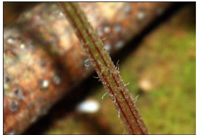
Top: Leaf, Williamstown, MA. Bottom: Basal petiole, showing distinctive, paired, purple lines, Williamstown, MA.