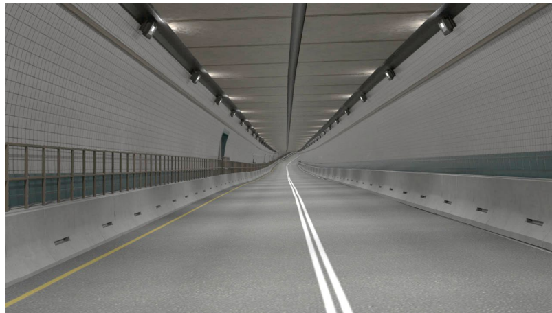
Rendering of TWT lighting replacement