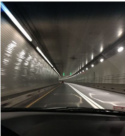
Example lighting replacement