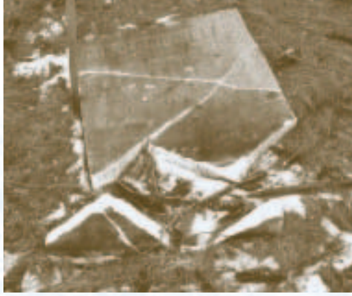
Limb damage, New Marlborough

Falling tree limbs can do permanent damage to grave markers and other historic artifacts within a burial ground.