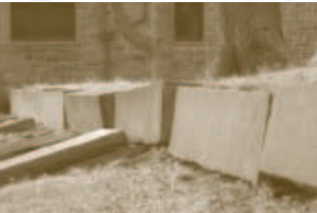
Root damage, First Church of Jamaica Plain Cemetery

Trees that are located too close to a grave marker may topple or even grow around the stone.