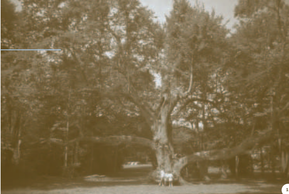
Littleleaf linden tree, Marshfield