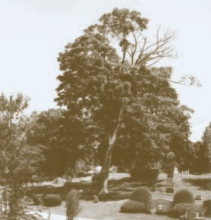
Mount Wollaston Cemetery, Quincy

The lack of leaves on the upper branches of this tree indicates that the limbs have died, and may be a sign of poor tree health. Dead limbs have the potential to fall and cause damage – in this case to cemetery visitors and grave markers.