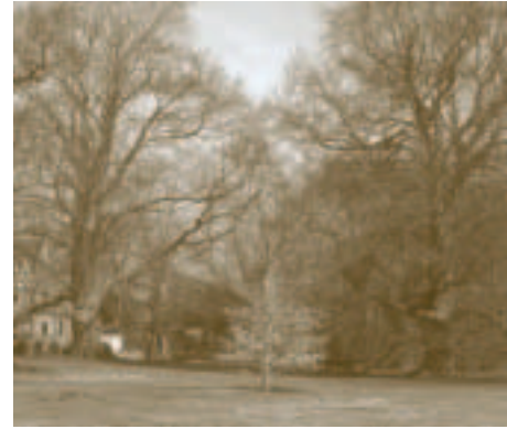
Longwood Mall, Brookline

Planting a tree, which requires digging a hole as much as three times the diameter of the root ball, also has the potential to disturb other landscape features and archaeological artifacts. Locating the new tree in the same location as or next to a previous planting (interplanting) may minimize the impact, since the soil in that area has already been disturbed. In any landscape that is potentially archaeologically sensitive, consult with the archaeological staff at the Massachusetts Historical Commission (MHC) for guidance prior to removing an old tree or planting a new one. Depending on the source of funding for the work, for example if the tree work is part of a project that received a state or federal grant, you may be required to consult with the MHC. In this case, MHC staff would review the project to assess its potential impact on any historic resources, archaeological or otherwise. MHC staff can also help determine the sensitivity of the site, if you are unsure.