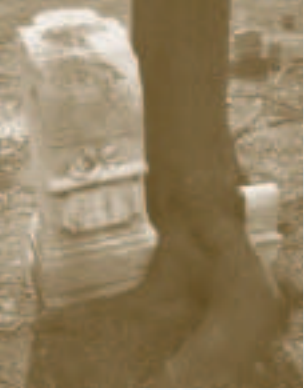
Tree trunk damage, Chelsea Garden Cemetery

Falling tree limbs can do permanent damage to grave markers and other historic artifacts within a burial ground.