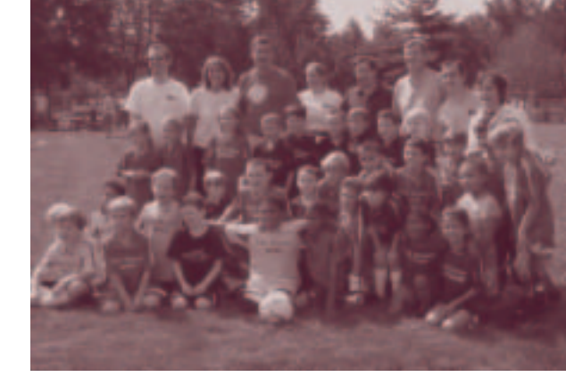
Teddy Ebersol's Red Sox Fields at Lederman Park: $1.8 million donated from private partners with over $200,000 of capital investment through OPPP and DCR to rehabilitate athletic fields along the Esplanade in Boston. The gift also includes a private, $1 million maintenance endowment being generated in response to a $500,000 matching fund challenge from the Ebersol family. (OPPP)

For more information on OPPP's "Fix it First Friends" program, visit their internet site at www.mass.gov/envir/opp or call (617) 626-4917.