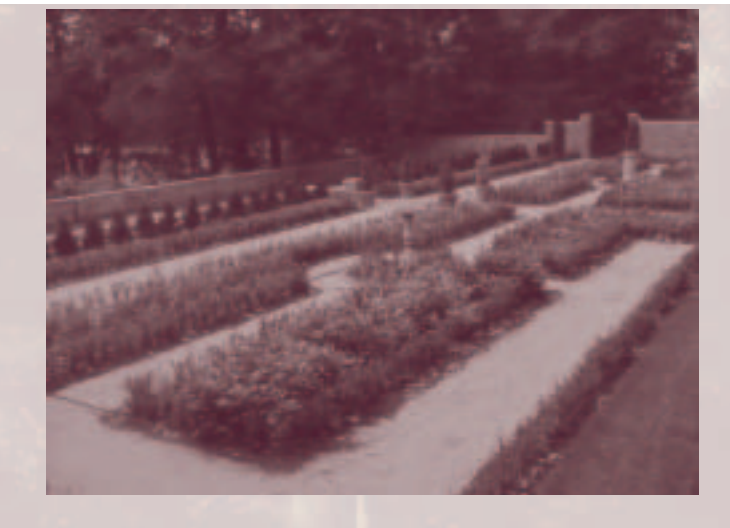
The Maudslay State Park Association Garden Committee is instrumental in the upkeep of the park's designed landscape. (DCR)