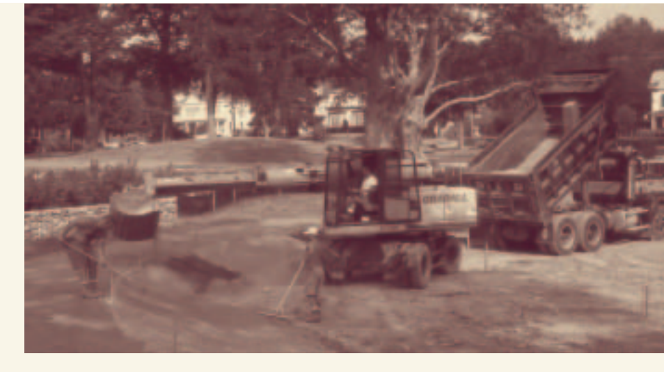
The pond rehabilitation at Whitman Park was organized and funded by the Friends of Whitman Park. (June O'Leary)