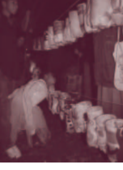
Spontaneous Celebrations, a nonprofit partner of DCR, programs the Lantern Parade on Jamaica Pond every October.

Landscape stewards can encourage partners to become involved in capital planning and design processes to help develop alternative concepts and methodologies that address the needs and desires of the local constituency. Early public involvement engages the community and fosters support of park needs.