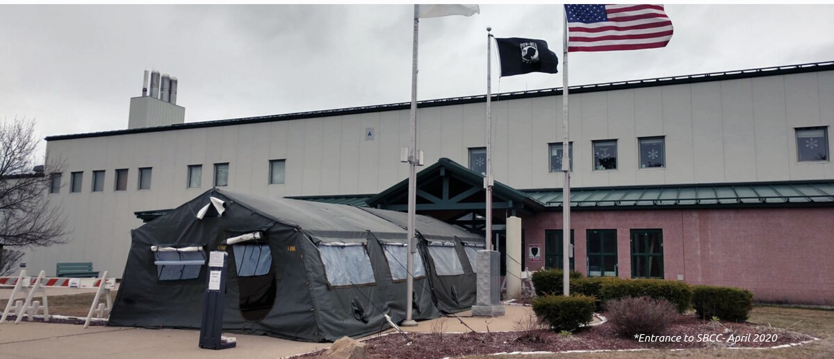
*Entrance to SBCC- April 2020

*Please note these numbers do not include PPE that was already present at the facility prior to the above deliveries.