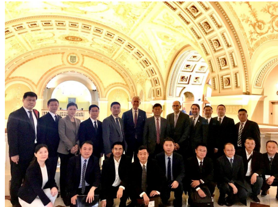
Pictured below with the delegation are Chief Justice Green, Justice Agnes and Justice Ditkoff.