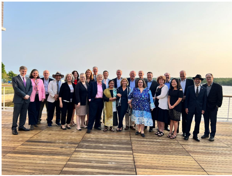
Appeals Court Justices in attendance at the Spring Education Conference