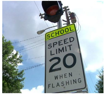
No parking any time (MUTCD R7-1)