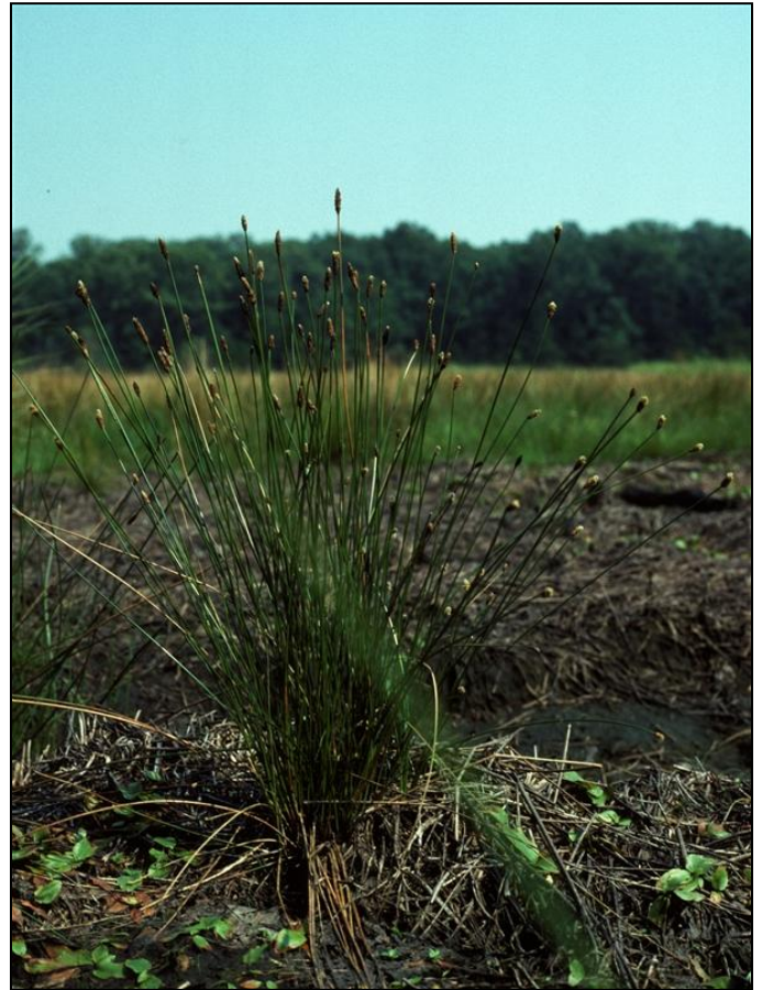
Three-angled Spike-sedge grows in clumps (above), or spreads along rhizomes to form patches. Its achenes have small tubercles and no bristles.

AIDS TO IDENTIFICATION: To identify Three-angled Spike-sedge and other Eleocharis species, a technical manual must be consulted and mature fruit examined with a hand lens or microscope. The genus Eleocharis is characterized by a single “spike” of inconspicuous flowers at the top of the stem. The achenes (dry, single-seeded fruits) have a small projection (tubercle) on the top that varies in size, shape, and texture among species. Mature achenes of Three-angled Spike-sedge have very small tubercles, are triangular in cross-section with convex sides and no