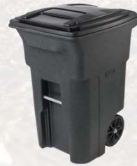
64- Gallon Bin