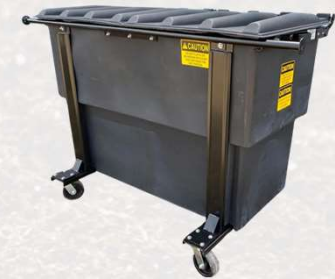
1-3 Yard Dumpsters