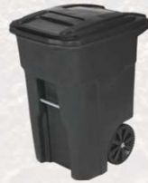
48- Gallon Wheeled Bin