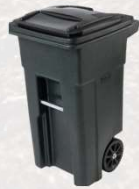
32- Gallon Wheeled Bin