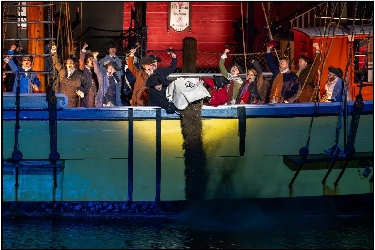
Pictured: 250th Anniversary Celebration of the Boston Tea Party on December 16, 2023