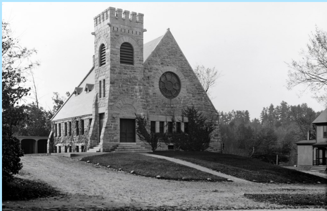
First Baptist Church, Oct. 16, 1897

Serves as a monument to the buildings that were removed from the Nashua River Valley to create the Wachusett Reservoir. Today the Wachusett Reservoir, along with the Quabbin Reservoir and Ware River, are the unfiltered source of high quality water for the Massachusetts Water Resources Authority water supply system for over 3.1 million people.