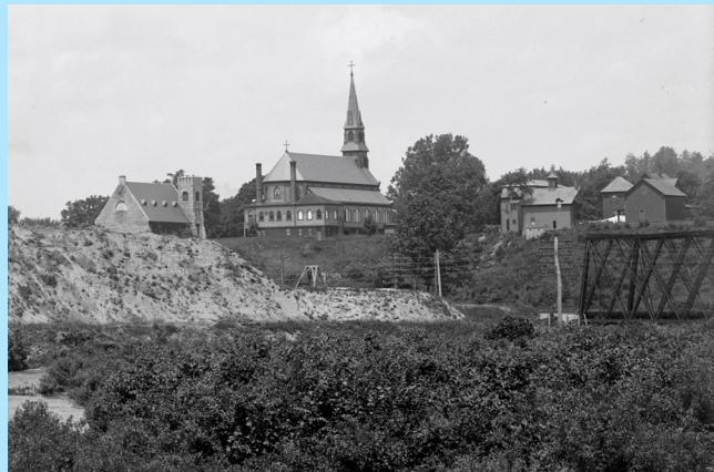
June 27, 1903

In just 5 years, the Metropolitan Water Board bought the church from the Baptist Society for the creation of the Wachusett Reservoir.