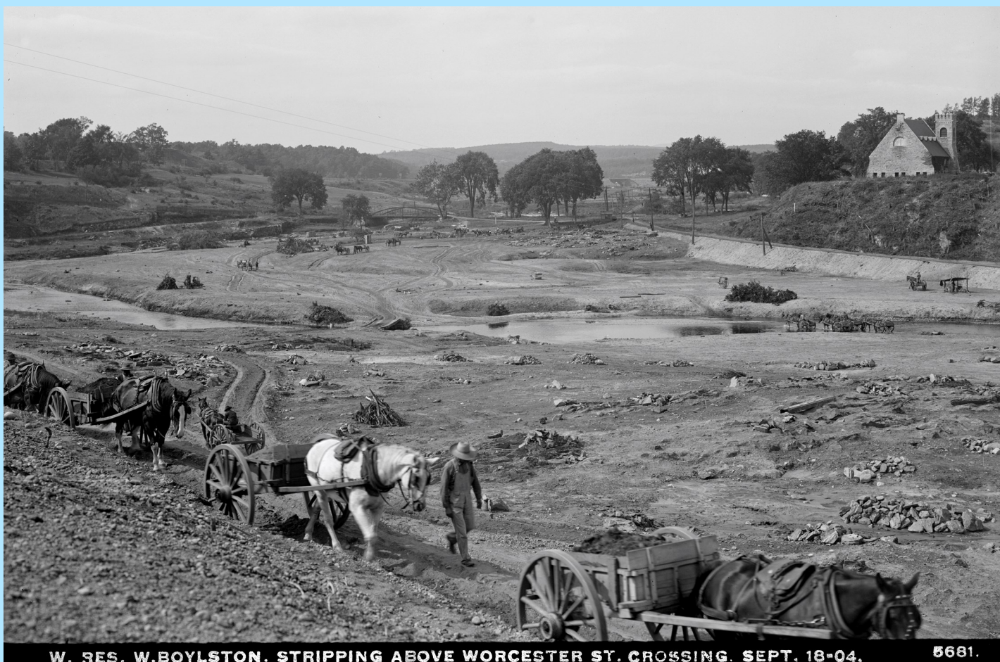
Stripping Soil, Sep. 18, 1904

You may still see evidence of this today, in the footprint of stones showing through the grass.