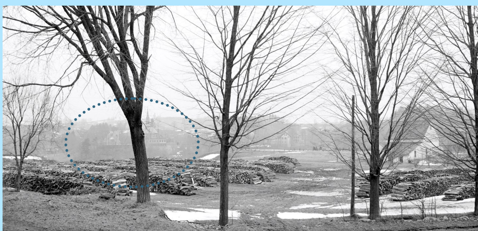
400 Cords of Wood, Mar. 12, 1902

The church was rebuilt to replicate the original as much as possible. Today it serves as a reminder of the past, offering comfort in its scenic value.