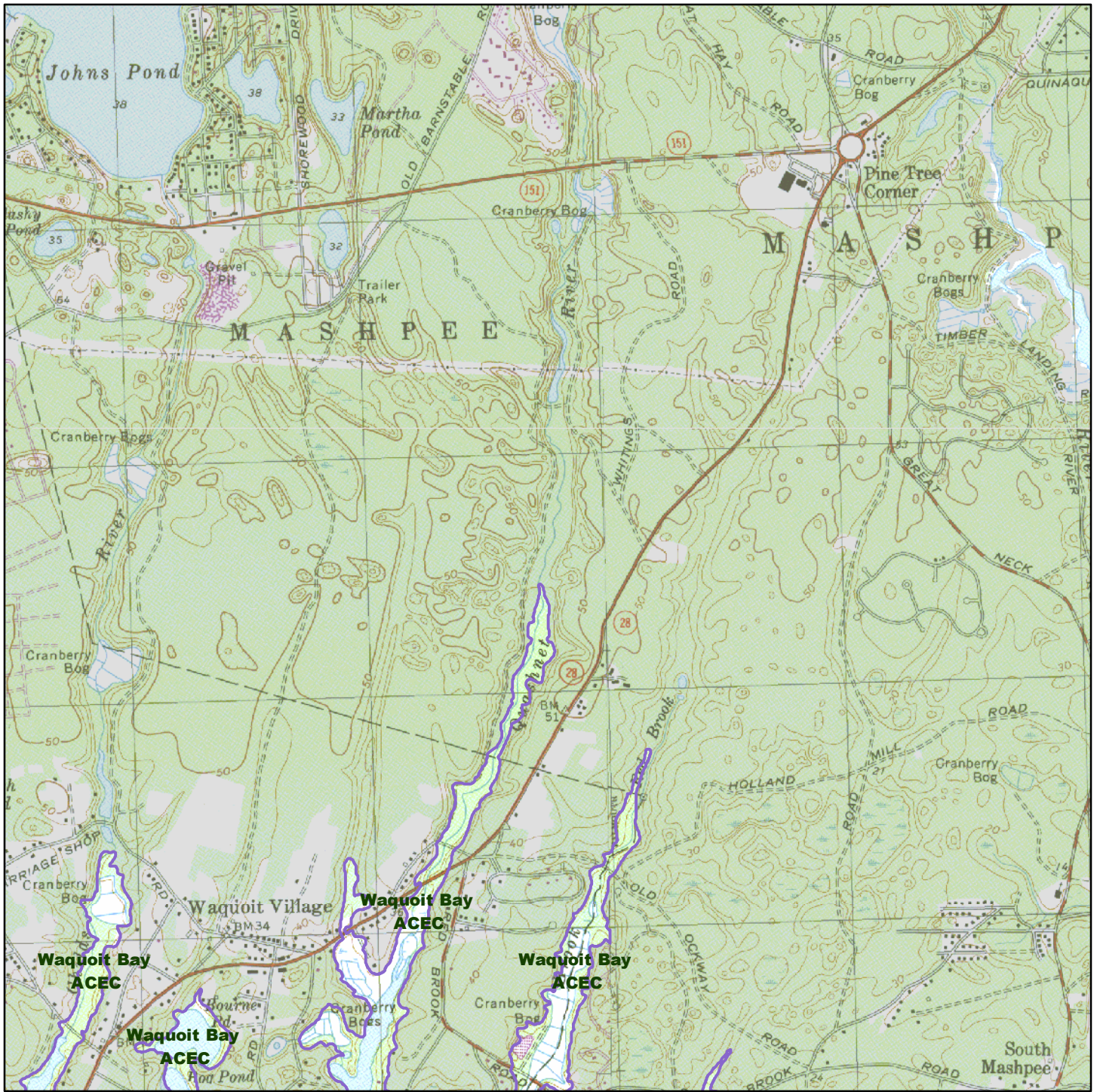
Map # 25a Waquoit Bay ACEC Map Tile 1 of 3 ACEC Designated 11/26/79 2,580 Acres