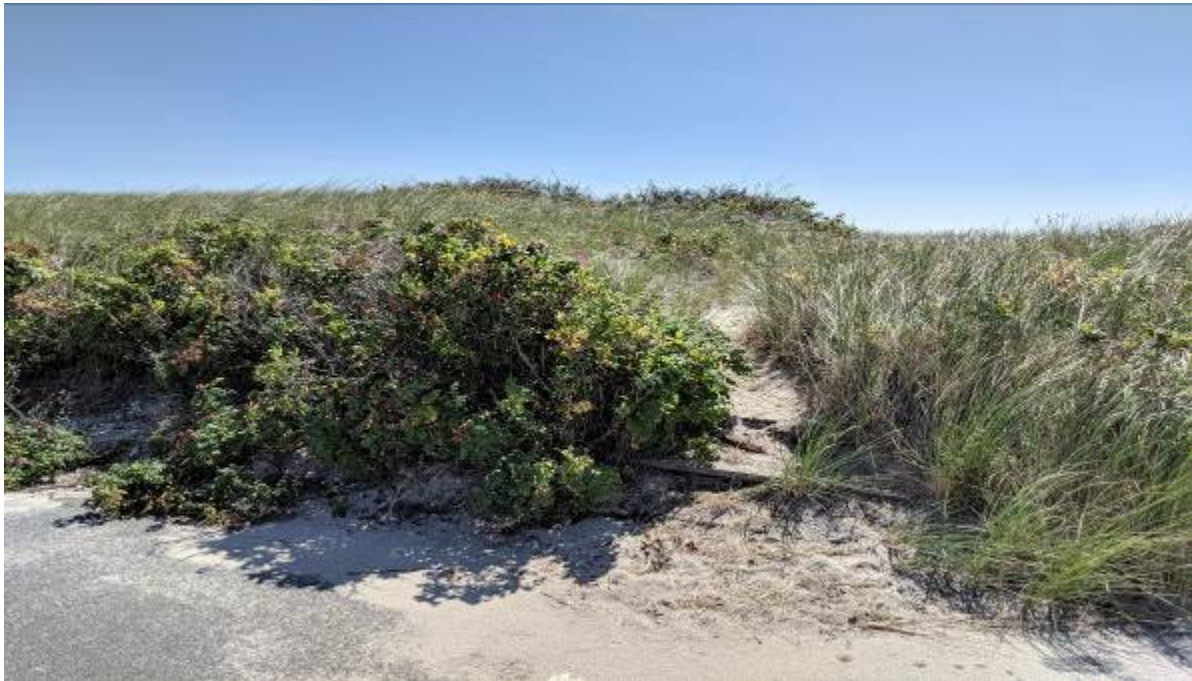
Exhibit 5: Path near bathhouse #2 which is most frequently used by plovers and chicks due to the proximity to nesting areas and a small foraging beach on the northern side of West Dennis Beach. Path will be maintained.