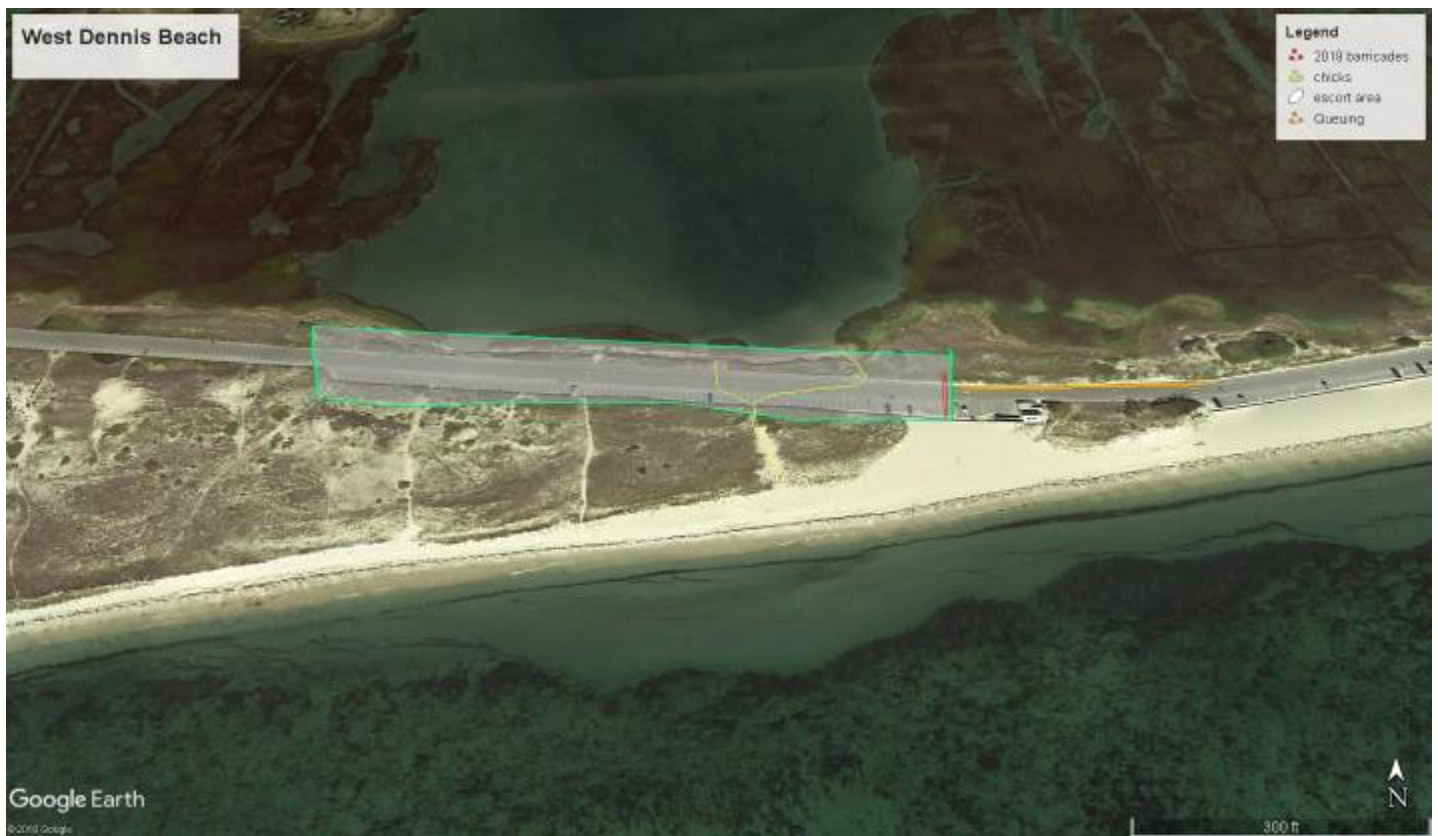
Figure 4: Aerial view of 2019 barricaded area, with the potential escort area. The yellow lines indicate chick movement to and from the beach and the orange line indicating potential queuing area for proposed escort across restricted area (See Section 4.2).