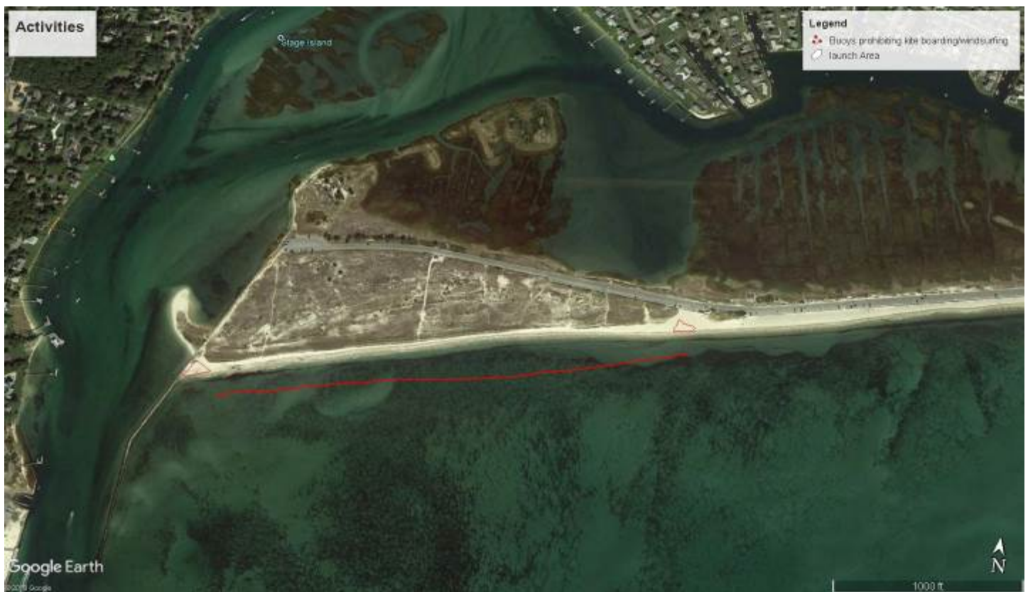
Figure 2: Map with red line displaying the area which is off limits for Kiteboarding and Windsurfing. Buoys demarcate this area for recreationalists. Two small red polygons are known launching site for these activities.