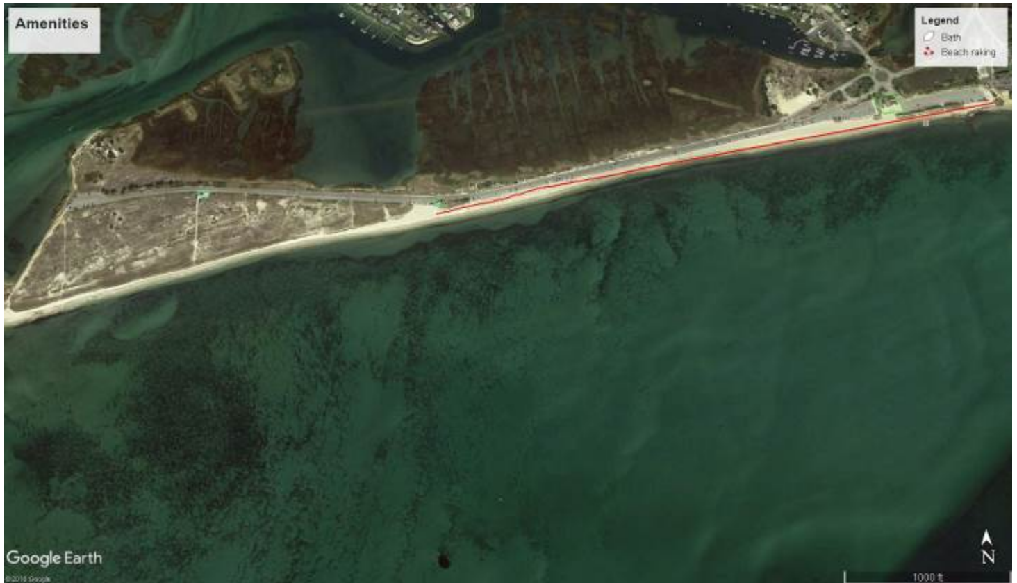
Figure 1: Map showing the extent of raking activities between the eastern end of West Dennis Beach and bathhouse #2. Each bathhouse (#1 through #3, from right to left) are shown with green circles.

The beach is routinely raked during the summer seasons to remove seaweed and trash from the bathing area. Raking activities do not extend past the middle bathhouse building (bathhouse #2) into plover nesting and foraging areas (Figure 1). No dogs are permitted on the beach from April 1 st through Labor Day.