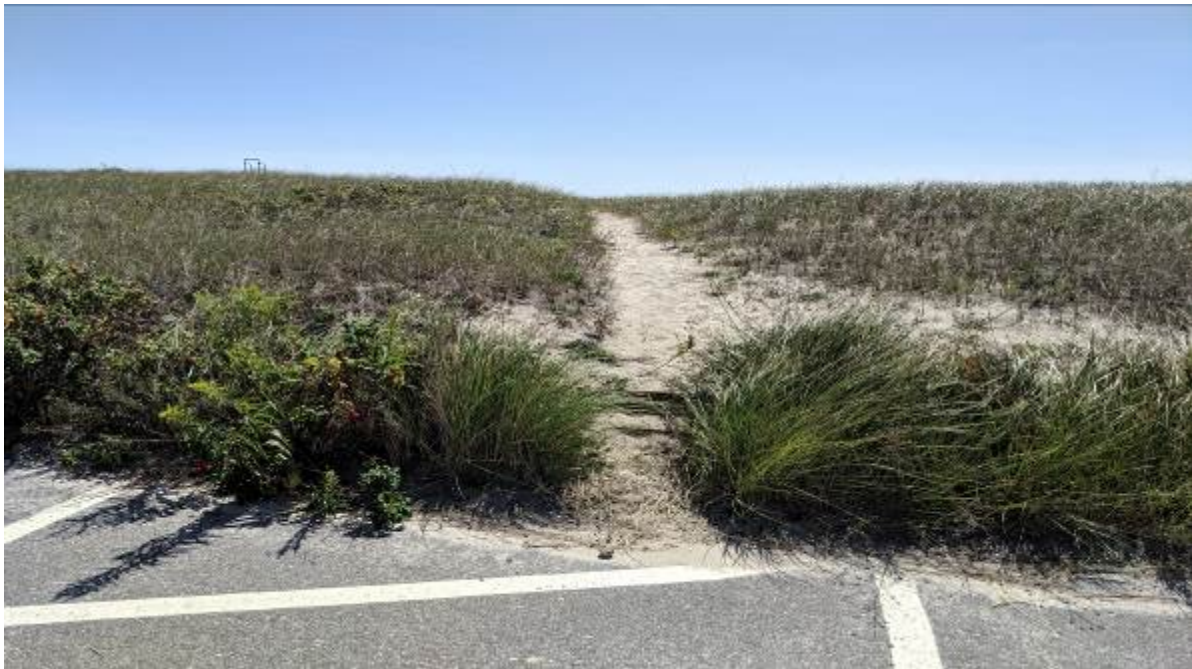
Exhibit 6: Path not frequently used by plovers and chicks, slightly further from aforementioned foraging area on northern side of West Dennis Beach. Will be planted and roped-off.