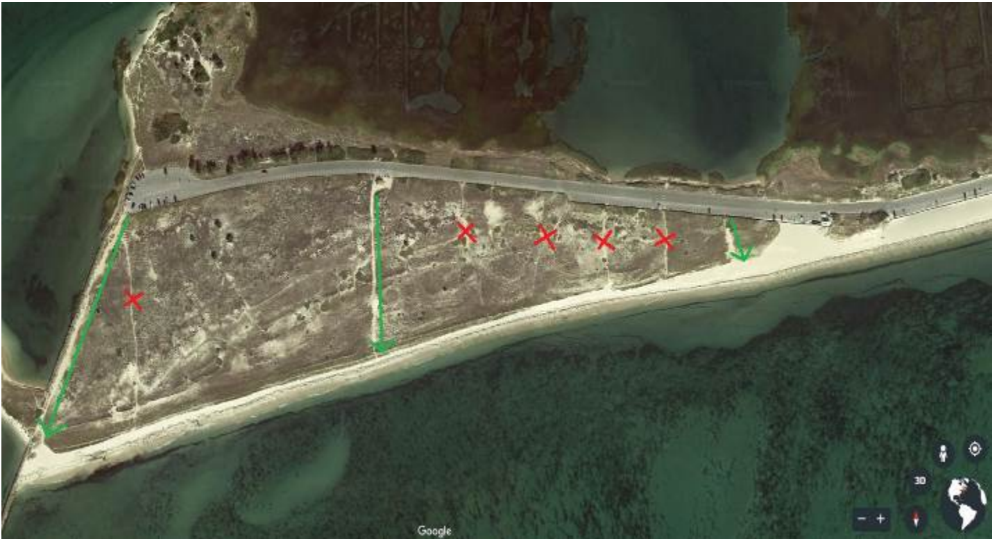
Figure 5: Figure displaying all paths, sanctioned and unsanctioned, west of bathhouse #2. All paths marked with green arrows will remain. All paths and side trails marked with a red 'x' will be planted from the northern edge and roped off as previously specified.

vegetative barriers may serve to minimize predator access from parking areas where trash and debris attract skunks, raccoons, coyotes, seagulls and crows.