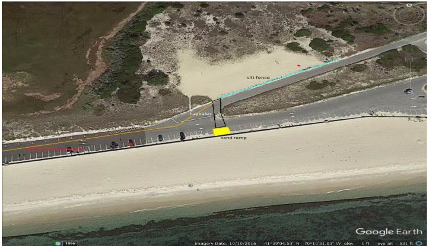
Figure 3: Aerial view of moveable Plover and chick pathway and silt fence utilized to facilitate safe crossing from the northern side of West Dennis Beach (Volleyball Area) to the beach front on the southern side of West Dennis Beach.

roadway). This will prevent plovers (adults and chicks) from entering the adjacent access road. This fencing also serves to guide adults and chicks southwest towards a temporary haybale-lined, sand-covered, road crossing which will be installed, adjusted, and monitored each day to allow crossings to and from the beach foraging area. This staged crossing will have a built-up sand mound, acting as a ramp to allow plovers to cross over the bulkhead at the edge of the beach.