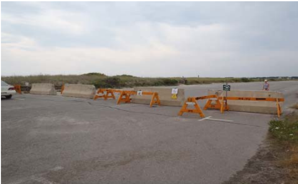
Exhibit 3: Barricade established at West Dennis Beach during the periods where nests are confirmed near the parking lot and/or roadway.

Currently barricades are established after a plover nest near the parking lot is noted, which acts to eliminate all further traffic beyond the barricaded site. These barricades are not removed until the chicks associated with the confirmed nest(s) have fledged or the nest has been confirmed to be abandoned/predated. No vehicle traffic, excepting emergency vehicles, is permitted past the barriers. The placement of these barriers cut off a significant amount of parking lot, resulting in the loss of more than half of all available parking spaces. This closure is enacted in part to protect a segment of roadway near the volleyball area where plover chicks have been recorded crossing with adults between the front beach and the bayside flats. In addition, plovers have been noted using several of the auxiliary dune paths to access the bayside flats from the beach or vice versa. This reduced the predictability of the plover's movements, especially during dawn and dusk hours, and opens a wider area where travel within paved areas could potentially occur.