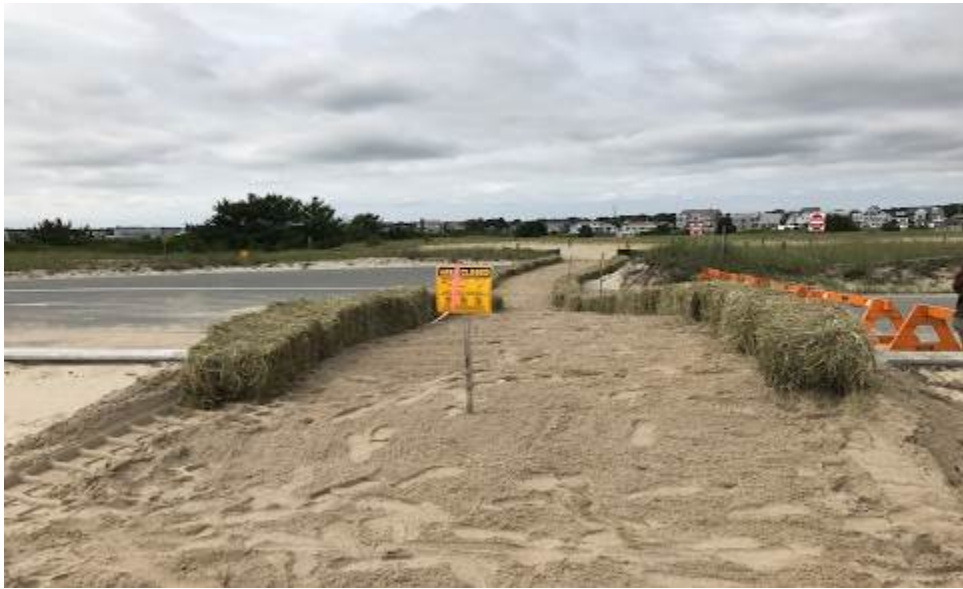
Exhibit 4: Moveable Plover and chick pathway utilized to facilitate safe crossing from the northern side of West Dennis Beach to the beach front on the southern side of West Dennis Beach.

Once a full clutch is found at the volleyball court, an estimated hatch date is determined. No less than 48 hours prior to that date the Town installs silt fencing and the sand ramp at the bulkhead. Haybales are staged for installation as well. During this time, the nest is monitored daily. Beginning on the hatch date, or earlier if signs of hatching are seen, the nest is monitored continuously between dawn and dusk. The access way is closed to traffic and western parking areas are closed as well. The portion of the “plover crossing” extending across the parking lot pavement is completed; haybales are installed lining the crossing footprint and sand is laid down extending to the ramp and beach. The family is monitored daily and once they begin to move, staff will ensure they do not stray into unprotected parking lot areas. Limited herding will be used for this purpose. Once the adults and chicks are safely established on the beach, the crossing will be dismantled and traffic will be allowed to resume 24-48 hours after the chicks have crossed and are established on the beach.