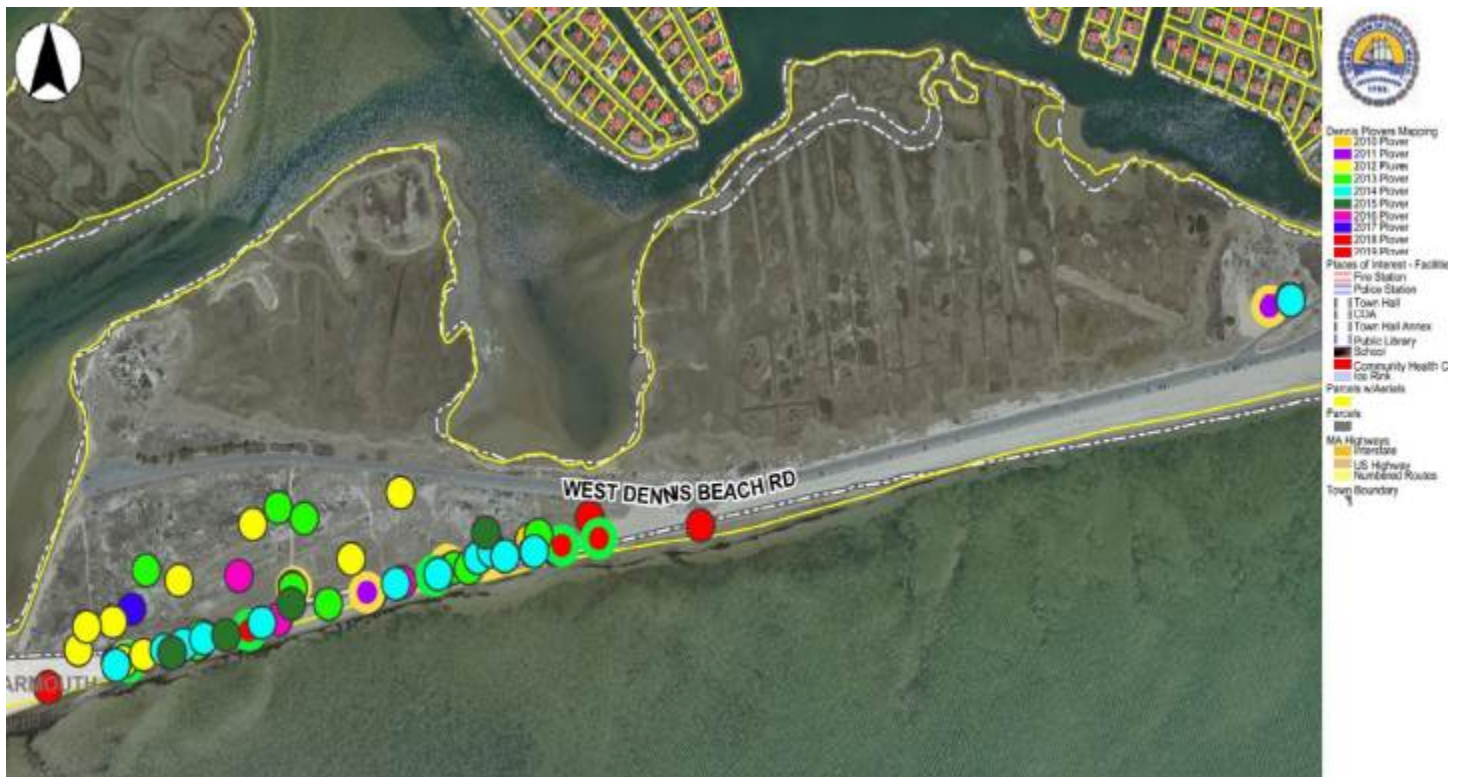
Exhibit 2: Map of all nesting locations between 2010 and 2019