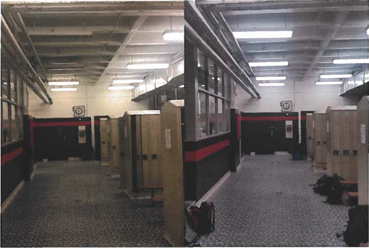
Westfield High School Gymnasium Before and After of Locker Room Re-Lamp and Re-Ballast