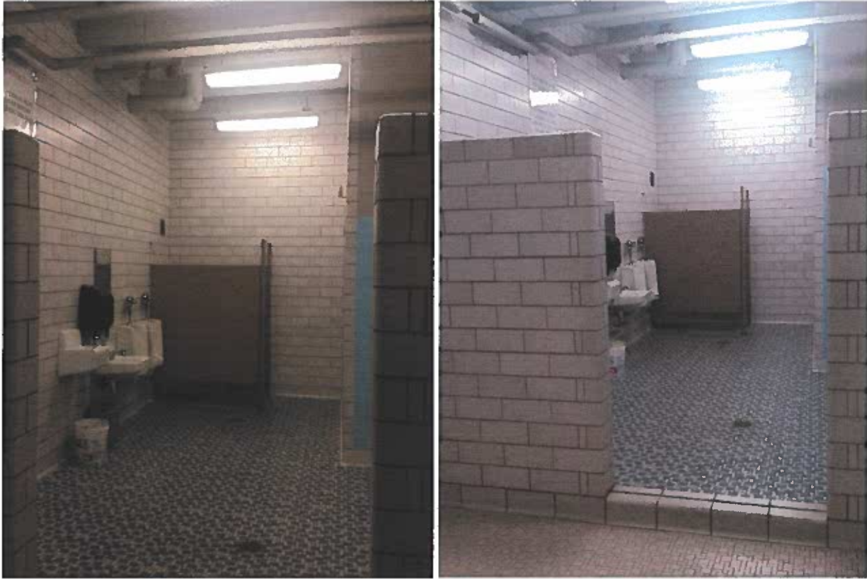
Westfield High School Pool Before and After Retrofit