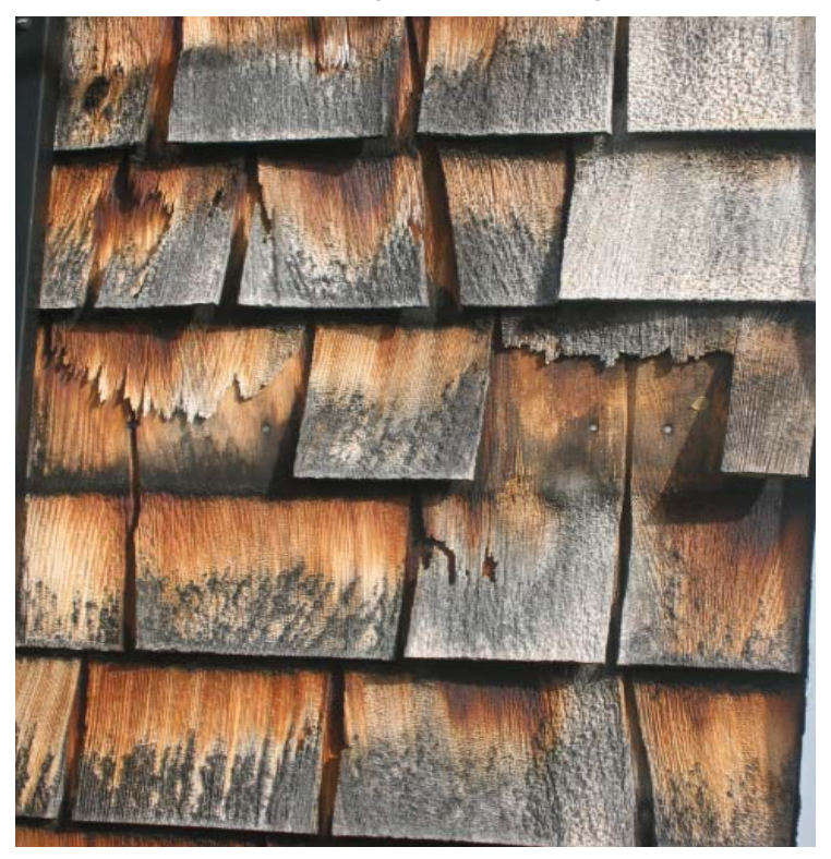
667-1 Development, 4F Greenwood Terrace Warped Shingles Need Replacing