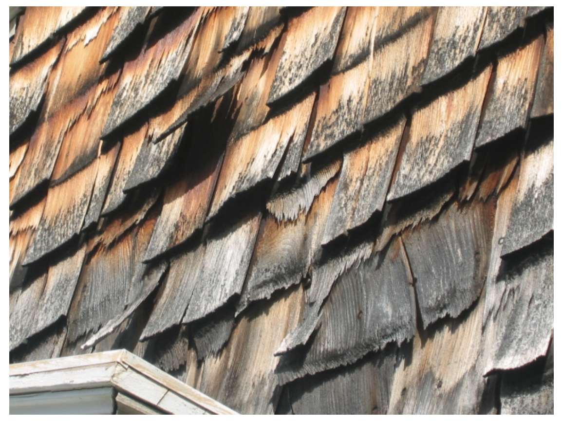
667-1 Development, 6A Greenwood Terrace Warped Shingles Need Replacing