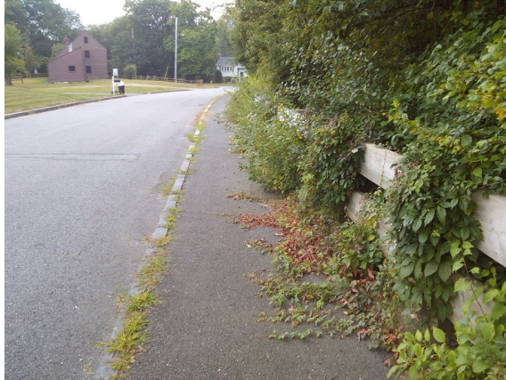
Figure 3 – Nuisance and Invasive Vegetation on Marion Street Nuisance vegetation creates a public safety hazard to workers and pedestrians.