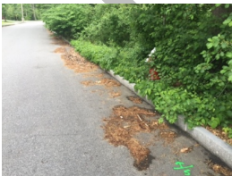
Marion Street – (Prior to implementing VMP)