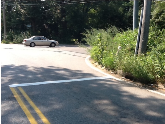
Figure 1 – Hazard Vegetation at intersection of Concord Street and Woburn Street Hazard vegetation obstructs site distance at critical intersections.