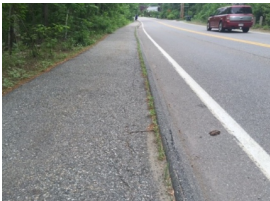
Federal Street (Prior to implementing VMP)

* Year 2 indicates shortened spray routes due to 24-month no spray restrictions in Zone 2 areas