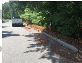
Marion Street (After implementing VMP; Chemical Control)