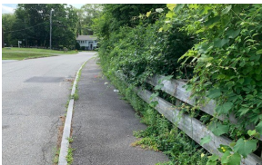
Marion Street – (Prior to implementing VMP)