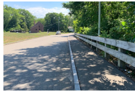
Marion Street – (After implementing VMP)