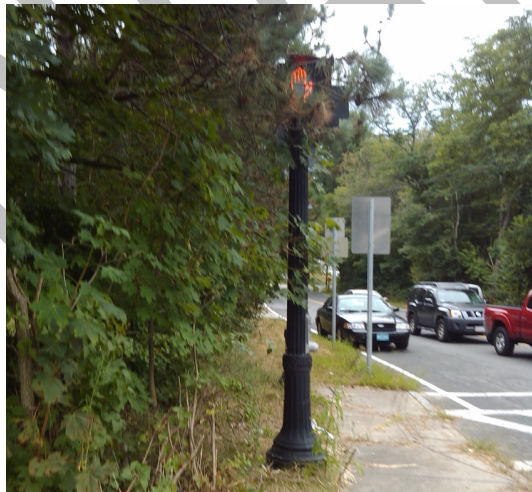
Figure 4 –Hazard Vegetation blocking a traffic signal at Woburn Street and Salem Street Hazard vegetation obstructs critical utilities.