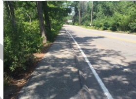
Federal Street (After implementing VMP; Mechanical & Chemical Controls)