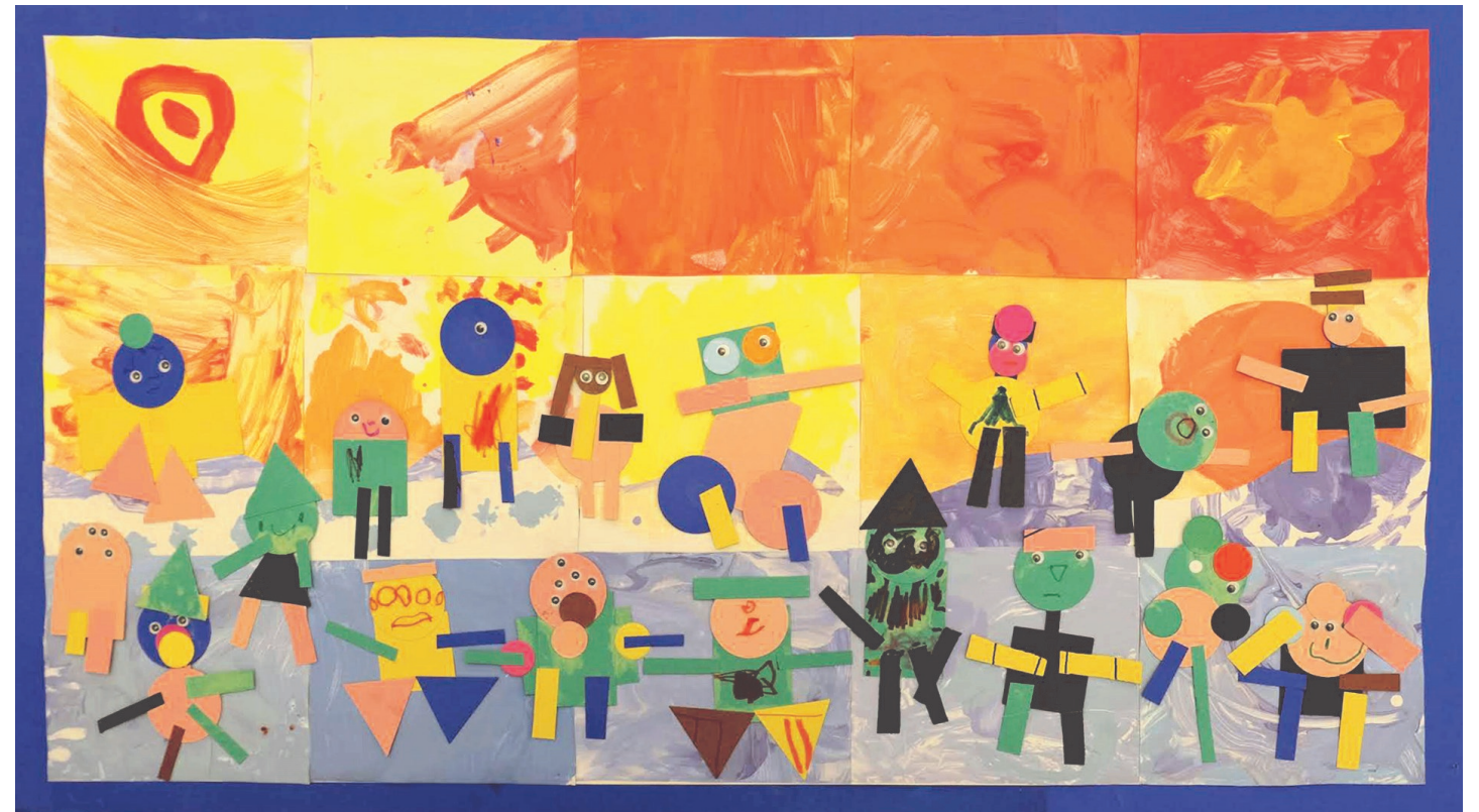
Selected contest entry by Commonwealth Children's Center

MOD staff were very impressed that the children were able to use our art contest as an opportunity to explore what it means to live with a disability and learn about a successful American artist with a disability.