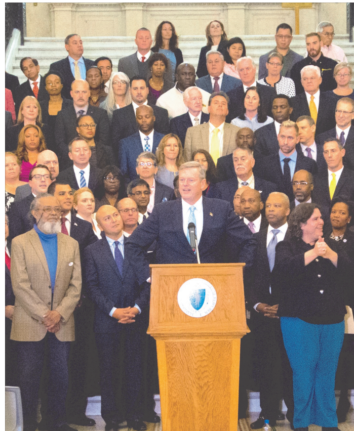
Governor Charlie Baker announces changes to the Supplier Diversity Program from the Grand Staircase of the Massachusetts State House