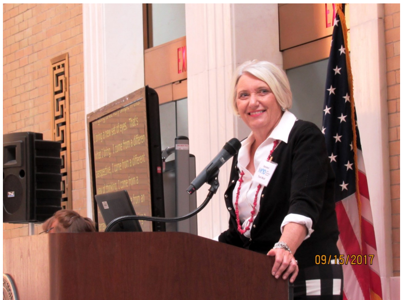
MRC Commissioner Toni Wolf

Successful employment outcomes foster dignity, self-determination, and independence, which are goals at the core of MOD's mission.