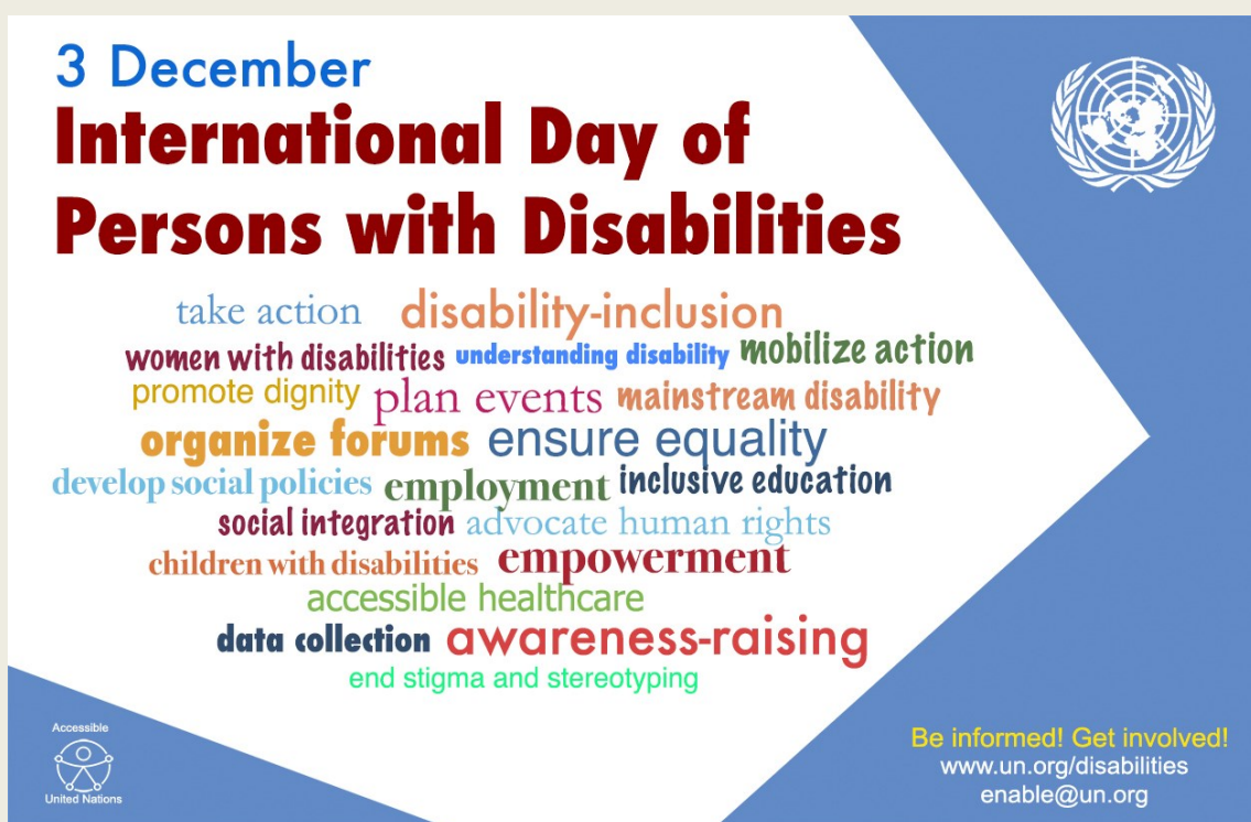
IDPD 2017 Poster

With this year’s focus on sustainability and inclusion in disaster response, the UN suggests holding inclusive and collaborative events, organizing forums and public discussions for all stakeholders, celebrating with events focusing on members of the disability community as change makers, and taking action by highlighting best practices and making recommendations to leaders. Find out more and download the IDPD poster at www.un.org/disabilities .