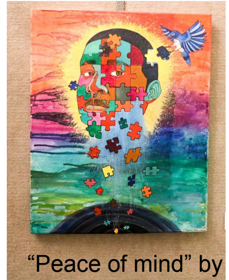
“Peace of mind” by Sherwin Long