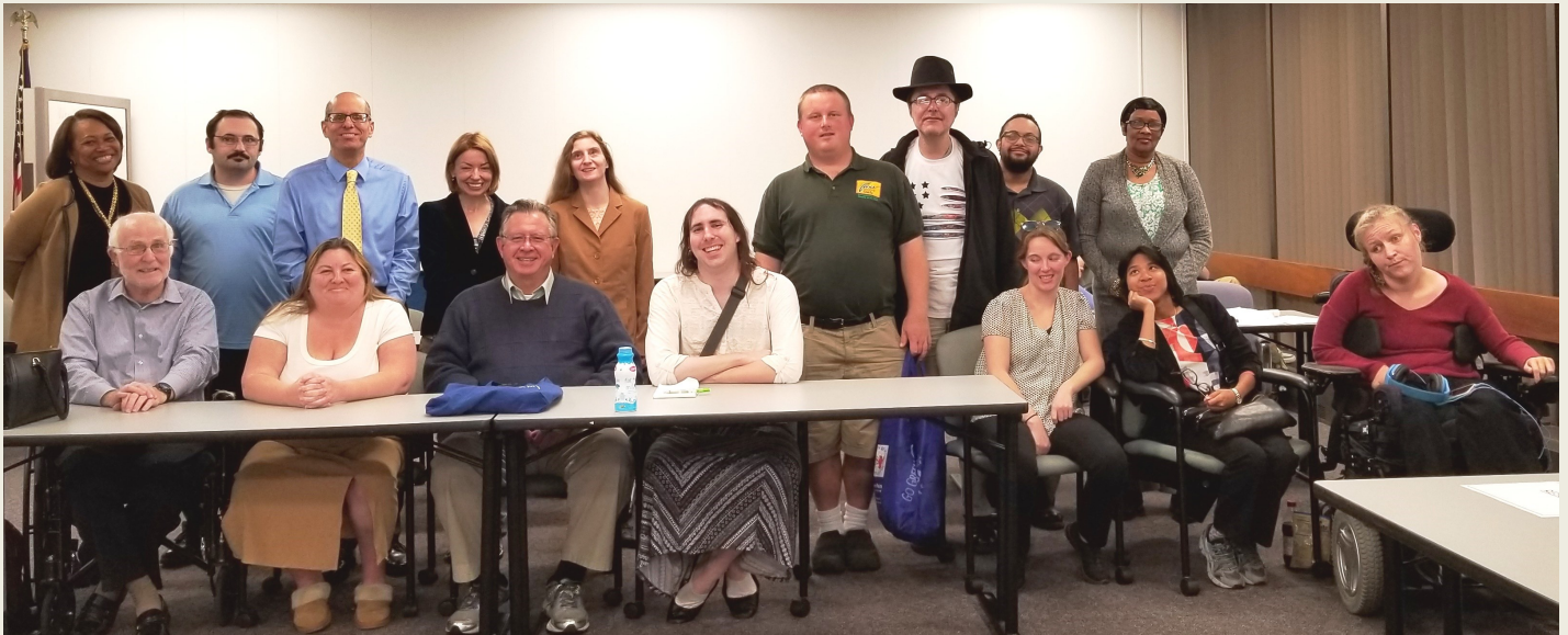
A few DMW 2017 Mentees in a MassCareers workshop

DMW was an opportunity for people with disabilities to explore career opportunities within Massachusetts state government. Several Massachusetts state agencies welcomed approximately 30 mentees. Each mentee was paired with a state employee working in the mentee's field of interest. Mentees also attended workshops on MassCareers , the state's hiring system, interviewing, and resume building. Feedback from both mentors and mentees has been overwhelmingly positive. We are looking forward to hosting this program again in the future.