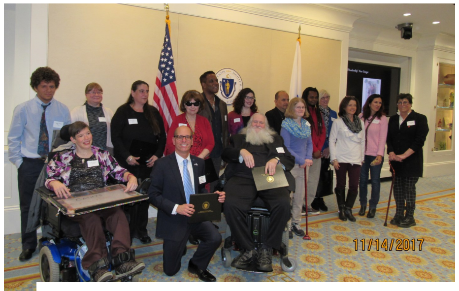
Artists and speakers at exhibit opening