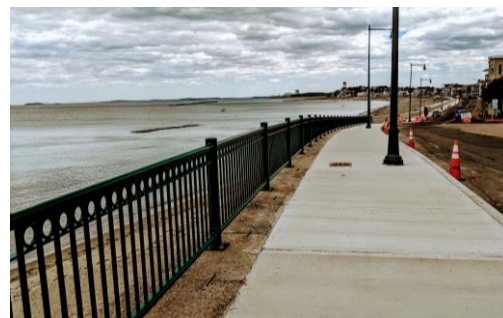
New ornamental railing.