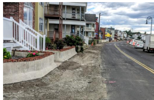
The temporary gravel surface will be replaced with new granite curbing and concrete sidewalks.

Join us on Twitter @MassDCR - Visit http://mass.gov/dcr