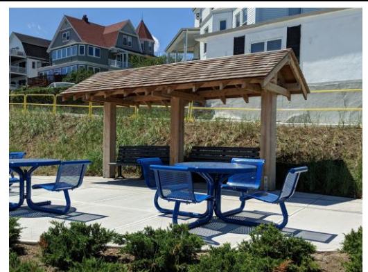
On a warmer day, last August, a view of the shade structure, tables and chairs in Highland Park

Join us on Twitter @MassDCR - Visit http://mass.gov/dcr