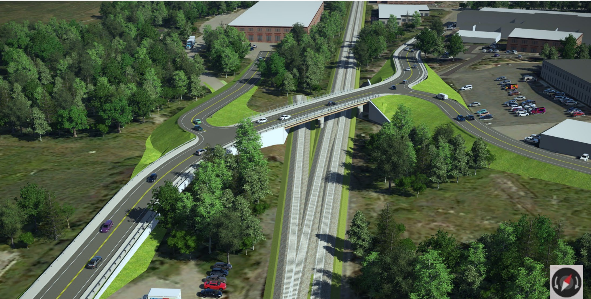
Rendering of Proposed Bridge