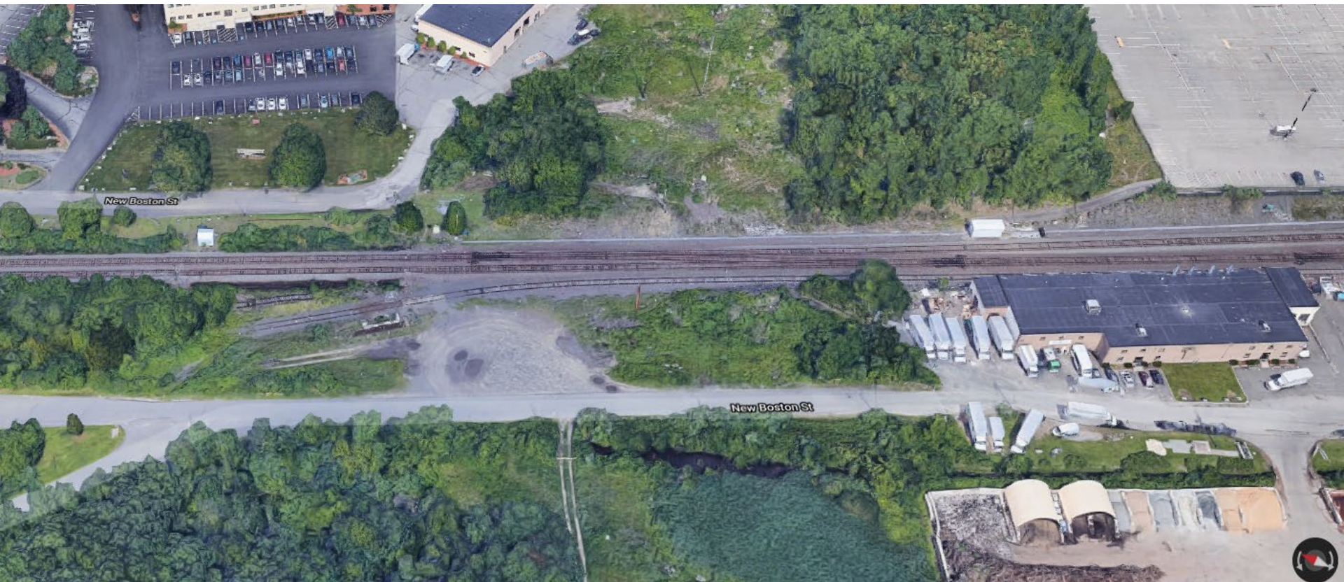
Existing Aerial View of Project Location