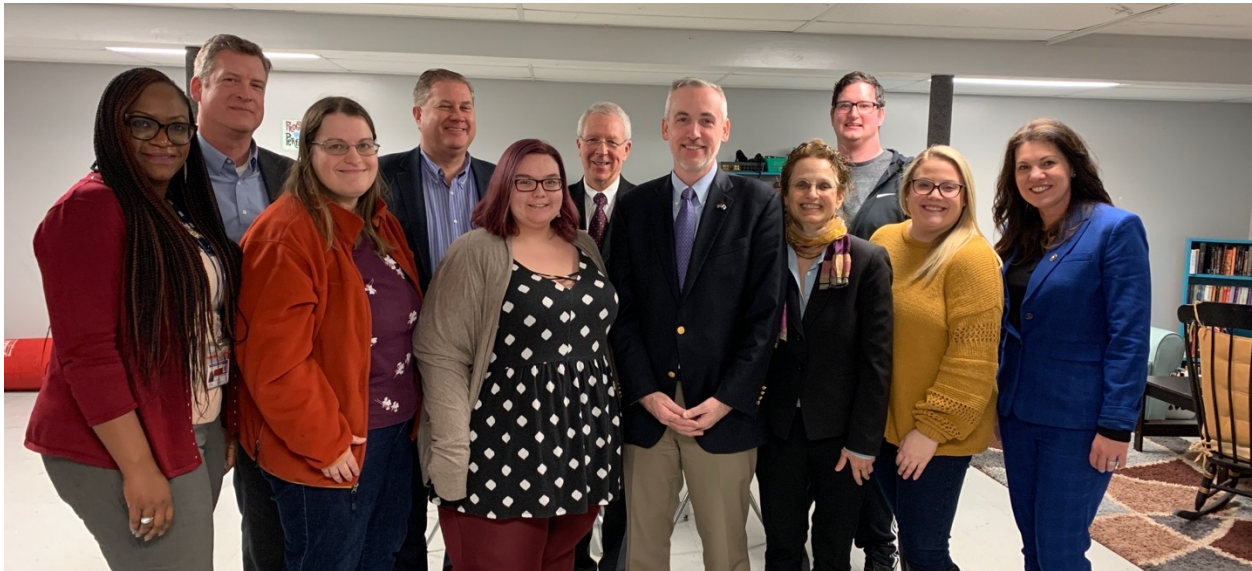
Members of the WorkAbility Subcommittee visited the Plymouth Bay Clubhouse managed by Vinfen, which offers support services for individuals recovering from mental illness.

Here are additional findings based on the Subcommittee's meetings, public hearings and stakeholder feedback: