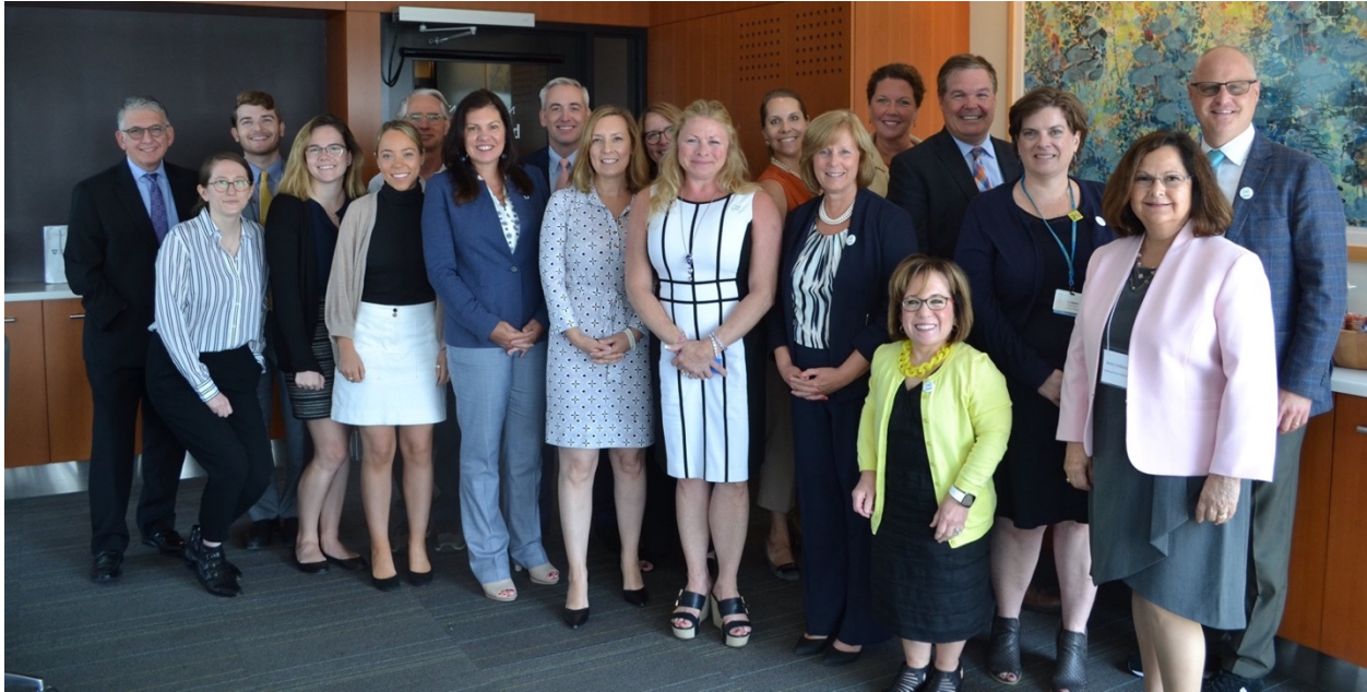
WorkAbility Subcommittee members visited Spaulding Rehabilitation Hospital in July 2019 for a tour and listening session with business leaders and Spaulding staff.