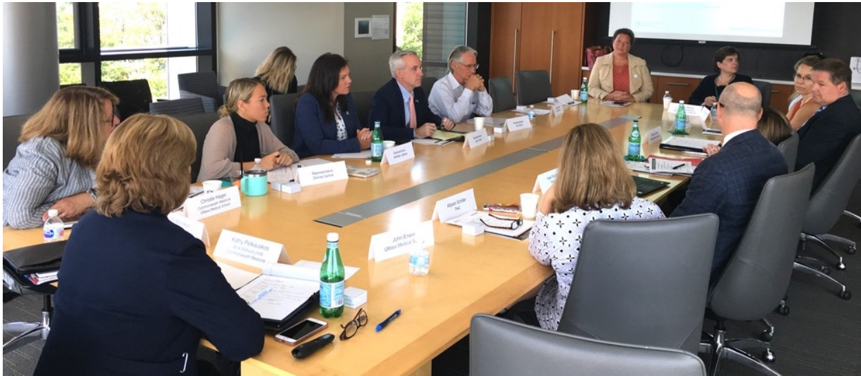
The Subcommittee met with UMass Medical School's Work Without Limits' Business Partners Roundtable to hear about successes and challenges in private sector disability hiring.

E. Barriers remain. While many companies and service providers have made strides in obtaining and retaining employment for individuals with disabilities, barriers to employment remain for individuals with disabilities. This section will outline the common themes and barriers that the Subcommittee heard during stakeholder meetings.