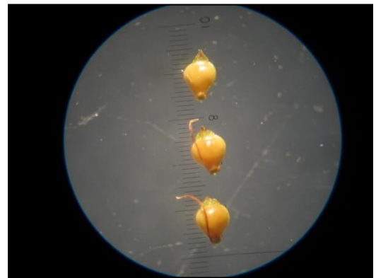
Wright's Spike-sedge has an ovoid terminal spikelet (top) and obovoid achenes with short triangular tubercles (bottom).

SIMILAR SPECIES: A technical manual should be consulted to identify Eleocharis species. Wright's Spike-sedge, Ovate Spike-sedge ( E. ovata ) and Bay Spike-sedge ( E. aestuum ) are similar, all having ovoid spikelets. They can be distinguished by examining the floral scales, perianth bristles, and tubercles. The tips of the floral scales are rounded in E. aestuum and acute in the other two species. Both E. diandra and E. aestuum lack (or have reduced) perianth bristles, whereas E. ovata has bristles that typically exceed the length of the achene. The three species also have differing tubercle