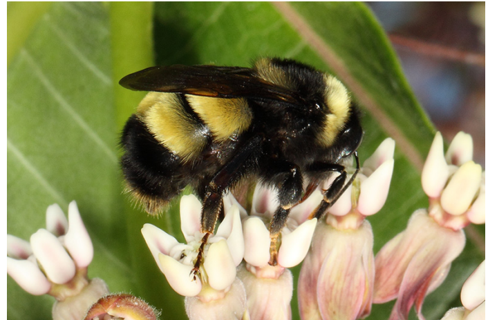
Bombus terricola , female ▪ NH: Coos Co., Whitefield ▪ 20 Jul 2012 ▪ Photo by M.F. Veit

DESCRIPTION: The Yellow-banded Bumble Bee ( Bombus terricola ) is of medium size, the queen 19-21 mm long, worker 10-15 mm, and male 13-15 mm (Williams et al. 2014). Color pattern is as follows: the face and upperside of the head are black, occasionally gray; the front of the thorax (just behind the head) is always yellow, contrasting with both the head and middle of the thorax, which are black (rarely gray); the rear of the thorax often has some yellow, but is usually mostly black or gray. The front of the abdomen is black, and the middle a wide yellow “band,” contrasting with both the front and the black rear. The rear of the abdomen usually has a small amount of yellow or orange at the tip. The Yellow-banded Bumble Bee may be confused with the American Bumble Bee ( Bombus pensylvanicus ), although the latter is currently very rare in Massachusetts. Upon examination in the hand, the Yellow-banded Bumble Bee has a head that is wider than long (opposite the case in the American Bumble Bee); longer antennae; and typically has yellow at the tip of the abdomen, unlike the queen and worker of the American (Williams et al. 2014).