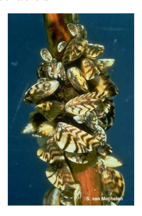
Figure 1 - A photograph of zebra mussels attached to a substrate.

The zebra mussel, Dreissena polymorpha , is a freshwater bivalve mollusk. Zebra mussels look like small clams with a yellowish to brownish shell shaped like the letter "D". The shell of the zebra mussel normally contains both dark and light-colored stripes, giving the mollusk its name (Figure 1), although some zebra mussels shells may be a solid brownish color. Adult zebra mussels can reach a length of two inches, but typically zebra mussels are one inch or less. Unlike most freshwater mussels, the zebra mussel grows in clusters containing numerous individuals. Zebra mussels are the only freshwater mollusk that can attach to solid objects, including rocks, logs, docks, boats, and various water intake pipes and instruments.