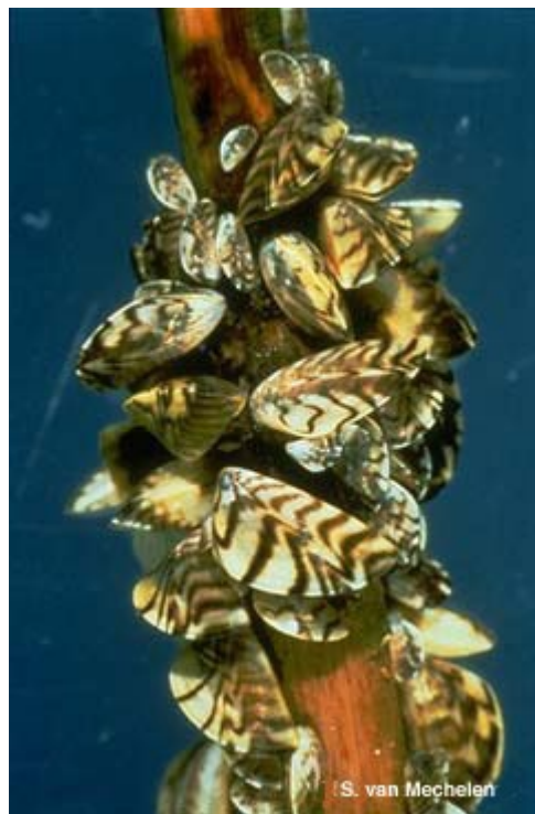
Figure 1 - A photograph of zebra mussels attached to a substrate.

The zebra mussel, Dreissena polymorpha , is a freshwater bivalve mollusk. Zebra mussels look like small clams with a yellowish to brownish shell shaped like the letter “D”. The shell of the zebra mussel normally contains both dark and light-colored stripes, giving the mollusk its name (Figure 1), although some zebra mussels shells may be a solid brownish color. Adult zebra mussels can reach a length of two inches, but typically zebra mussels are one inch or less. Unlike most freshwater mussels, the zebra mussel grows in clusters containing numerous individuals. Zebra mussels are the only freshwater mollusk that can attach to solid objects, including rocks, logs, docks, boats, and various water intake pipes and instruments.