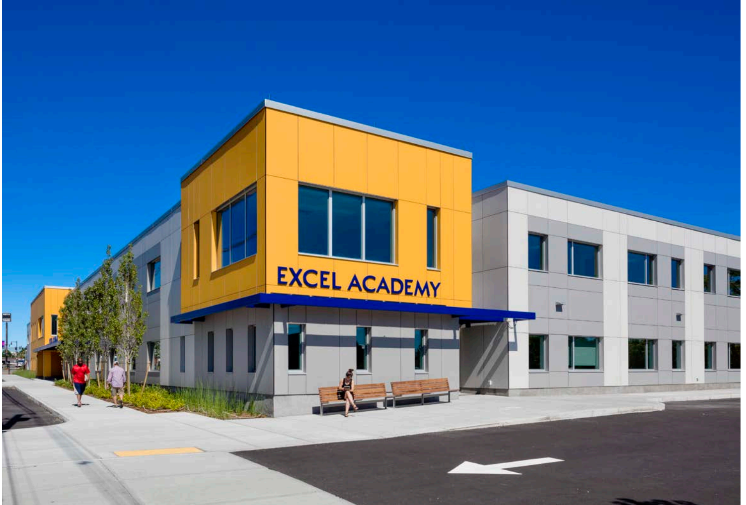
Excel Academy Charter School East Boston

Executive Office for Administration and Finance