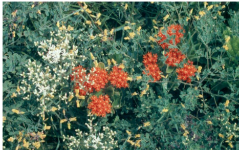
Butterfly weed with yellow wild indigo and an aster.

Characteristic Species: Sandplain Grasslands are dominated by graminoids, usually little bluestem grass, Pennsylvania sedge, and poverty grass, with bearberry, scrub oak, stiff aster, bayberry, lowbush blueberry, and black huckleberry with a variety of goldenrods. The shrubs often form clonal patches that provide <~25% cover overall. Although there is great species overlap with Sandplain Heathlands , Sandplain Grasslands are much richer in herbaceous vascular species, both native and non-native. Goat's rue, yellow wild indigo, butterfly weed, colic-root, and bird's foot violet are good indicators of the grassland community although they occur inland and in other dry habitats as well. Uncommon plants include sandplain gerardia, purple needle grass, commons' and harsh panic grass, sandplain and stiff yellow flax, and Bayard's adder's mouth.