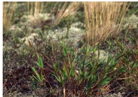
Common's panic grass with little bluestem.

species: the proportions of the species and the community structure separate the types. Sandplain Heathlands look shrubbier with a taller shrub layer comprised of scrub oak, black huckleberry, and/or lowbush blueberry, and overall have fewer plant species. Both Sandplain Grasslands and Maritime Dune Communities have grasses, forbs, and low shrubs, with patches of bare soil. Dune communities are often dominated by beach grass and beach heather that occur less abundantly in grasslands, where if they occur they are with other plants. Sandplain Grasslands - Inland Variant are located inland away from maritime influences and fewer coastal species including sandplain flax, golden heather, and sandplain blue-eyed grass.