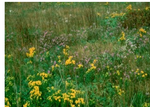
Sandplain Grassland mixed species.

Examples with Public Access: Katama Plains, Edgartown; Chilmark Cemetery, Chilmark; Head of the Plains and Middle Moors (NCF), Nantucket; Francis Crane WMA, Sandwich.