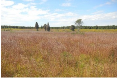
Sandplain Grassland dominated by little bluestem grass, managed by burning.

Description: Sandplain Grasslands are essentially treeless coastal communities dominated by native grasses and herbaceous species with sparse shrubs on sand or other dry, low nutrient soils. Occurrences receive onshore winds and salt spray of storms that delay succession to shrubland, woodland, and forest. Prior to European settlement they likely occurred as openings close to the coast where salt spray suppressed the growth of woody plants, and in openings created by windstorms, fires, and localized agricultural activities. The community also occurs in openings within Pitch Pine - Scrub Oak Communities, often in depressions (frost pockets) where frost can occur throughout the growing season inhibiting woody growth. Most current occurrences are on land that was previously farmed or disturbed and require management to remain open.