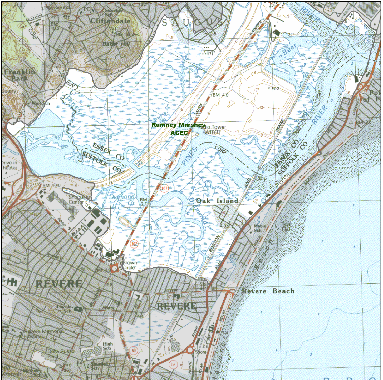
Map # 21b Rumney Marshes ACEC Map Tile 2 of 3 ACEC Designated 8/22/88 2,790 Acres