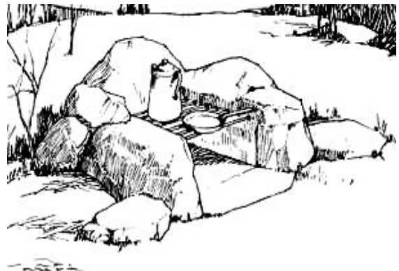
CCC-built picnic area fireplaces are still in use at York Lake.

York Pond Loop Trail is a Healthy Heart Trail to promote healthy outdoor recreation, also found at many DCR parks state-wide.