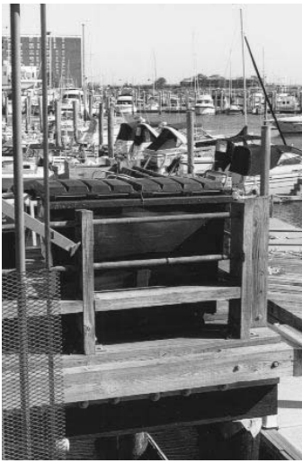
Covered dumpster at Seaport Landing Marina in Lynn.