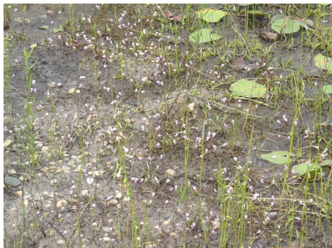
A Freshwater Mud Flat with stranded aquatic plants.

Differentiating from Related Communities: Freshwater Mud Flat Communities have low, sparse annual herbaceous vegetation on recently exposed muddy (fine mixed organic and mineral materials) sediments in rivers and ponds where they may include stranded aquatic vegetation. Low-energy Riverbank Communities are on slopes of river banks composed of a mix of relatively fine mineral materials (clay, silt, or sand). The stream bottoms of Low-energy Riverbanks can merge into FW Mud Flats; separation depends on patch