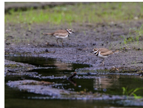
Killdeer on mucky sediments of a FW Mud Flat.

Examples with Public Access: Hop Brook WMA, Lee.