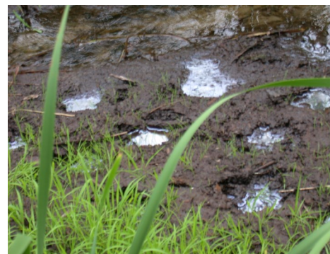
Oily water in footprints in the mucky sediments of a FW Mud Flat.

size and connectedness. High-energy Riverbank Communities occur along the shores of fast flowing, high energy rivers with sparse plants growing in sediment caught between rock cobbles. Riverine Pointbar and Beach Communities are along higher energy rivers on sand or gravel. Deep and Shallow Emergent Marshes have dense graminoid emergent plants on mucky sediments, often with standing water at the base of the plants. In tidal areas mud flats are considered to be parts of adjacent Freshwater or Brackish Tidal Marshes . Mud flats in coastal plain ponds are treated as parts of the Coastal Plain Pondshore Community . Mud flats that emerge after human mediated water lowering of lakes or rivers are usually temporary and would develop River and Lake Drawdown Communities that could be extensions of naturally occurring mud flats.