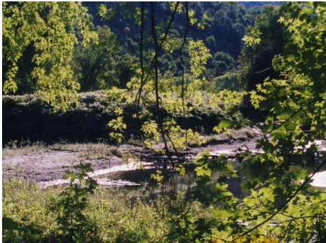
FW Mud Flat along the Housatonic River.

Description: Freshwater (FW) Mud Flat Communities develop over the summer as water levels go down and sediments are exposed in low-gradient and abandoned stream channels, backwaters, and beaver, oxbow, and other ponds that are usually flooded during winters or other times of high water. The mucky, silty mineral soils are poorly drained and may remain saturated even when the surface is exposed. Succession to other communities occurs at all sites when flooding is removed, particularly notable in abandoned beaver ponds.