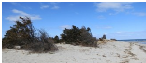
Maritime Juniper Woodland/Shrubland at the top of a foredune.

forests, in areas of continuous changes of levels of salt spray and substrate types. The dominant species is eastern red cedar (also called juniper), though the abundance of red cedar is highly variable. It grows in association with scattered trees and shrubs typical of the surrounding vegetation such as pitch pine, various oaks, black cherry, red maple, blueberries, huckleberries, sumac, and very often, poison ivy. Green briar can be abundant in more established woodlands, particularly along open edges. The herbaceous layer is highly variable, with little blue stem grass, beach grass, and sedges, often with scattered beach heather. Open areas have lichen patches. Microtopography and local conditions strongly influence the species assemblage.