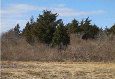
Maritime Juniper Woodland/Shrubland above a salt marsh.

Description: Maritime Juniper Woodland/Shrublands occur on and between sand dunes, on the upper edges of salt marshes and on cliffs and rocky headlands: all areas receiving salt spray from high winds. The maritime juniper community is evergreen, dominated by variable amounts of short (less than 15 ft.), often scattered eastern red cedar (juniper) sculpted by winds and salt spray. Although this community is often protected behind foredunes, occasional severe storms may deposit windblown salt, sand, and tidal overwash that damage or kill existing plants, altering the community for some years - and maintaining the mosaic of community types in the barrier beach system. The steepness of dune or bluff slopes and exposure to wind and salt spray maintain this as an open community. On flatter adjacent uplands, this community grades into denser forest, other maritime communities, and successional old fields.