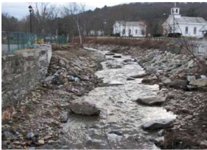
Boulders placed along the edge of restored stream channel to enhance fish passage upon removal of Ballou Dam in Becket, MA

Because dam removal projects may be (and have been) considered as limited projects under 310 CMR