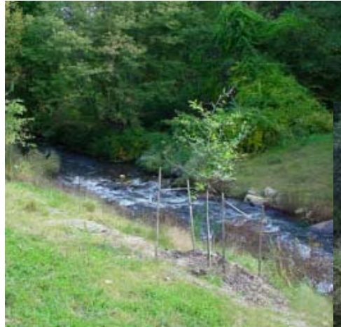
Town Brook in Plymouth, MA October 2003 After Dam Removal

serve to restore the ecology of riverine systems. Although a handful of dam removal projects have been accomplished in Massachusetts, hundreds have been successfully completed nationwide. Dam removal projects can contribute to the restoration of aquatic habitats upstream and downstream by restoring the natural movement of water and sediment, and by reestablishing more natural temperatures and oxygen levels. Dam removal projects can also improve flood management, storm damage prevention, and prevention of pollution in cases where the dam is otherwise in disrepair and represents a hazard. Since these projects can serve to improve the natural capacity of a river to protect the many interests of the WPA, they may be (and have been) permitted under 310 CMR 10.53(4). During permitting review of dam removal projects under the Wetlands Regulations, it is recommended that the following guidance be incorporated.