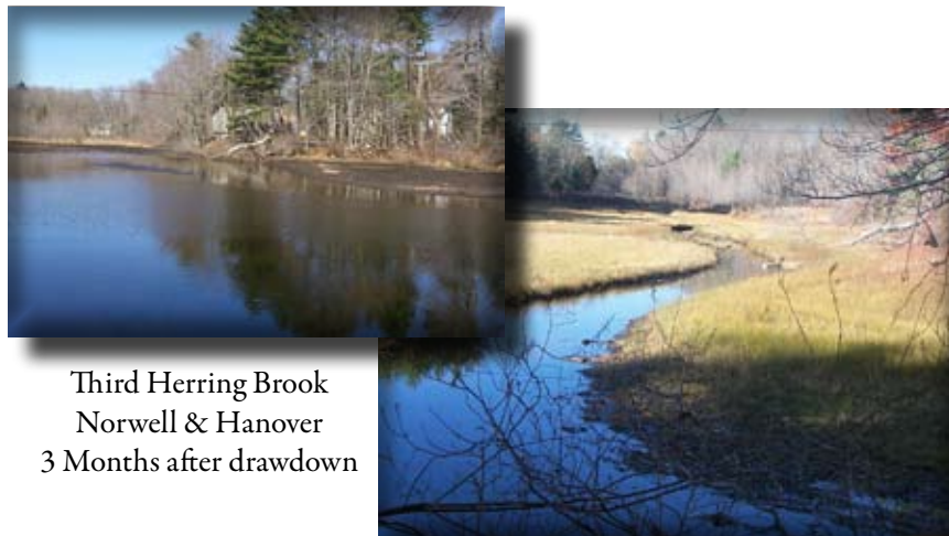
Third Herring Brook Norwell & Hanover 3 Months after drawdown

While many dam removal projects are initiated to prevent damage to human life and property resulting from dam failure, other dam projects may