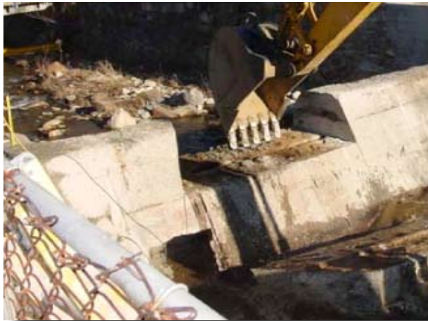
Concrete demolition at the Ballou Dam after a precision dam cut away from the adjacent retaining walls in Becket, MA.

There are two levels of monitoring at dam removal projects, post-construction monitoring and habitat monitoring. The first should be completed at all projects and includes periodically evaluating the project site for any risks to infrastructure such as utilities, retaining walls, bridges, and culverts, and evaluating the river channel for excessive erosion or sediment deposition. Photo stations should be set up to periodically create photo documentation of the site over time. Habitat monitoring can also be completed to assess the development of habitat features of particular interest at the project site. These features could include measurement of changes in vegetation (particularly invasive species), sediment, stream channel geometry, hydrology, fisheries and wildlife. 18