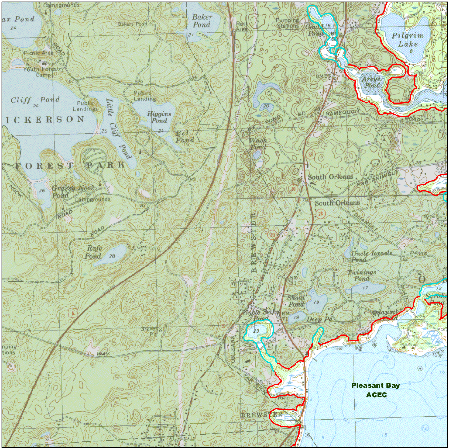
Map # 19c Pleasant Bay ACEC Map Tile 3 of 6 ACEC Designated 3/20/87 9,240 Acres